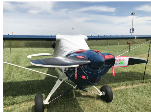
Cub Crafters EX2 Canopy Cover, Engine Plugs