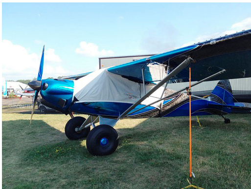
Cub Crafters Carbon Cub Canopy Cover

This cover type is made from Silver Acrylic Sunbrella canvas and is 100% lined with a soft and smooth microfiber. Bruce's Custom Covers developed this material combination especially for aircraft protection. The outer material is medium weight and treated for water resistance, UV resistance and anti-static buildup. The inner lining is a very soft and smooth microfiber to prevent scratching. The material is very reflective, and tests show that the cabin interior temperature can be reduced to near-ambient temperature on the hottest of days. It is water, ice and snow repellent, yet breathable to allow moisture to escape from between the cover and the aircraft surface.