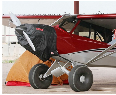
Cub Crafters Carbon Cub Insulated Engine Cover