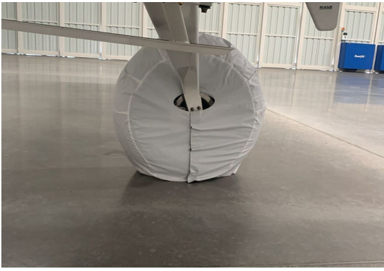
Cub Crafters Tire Covers, tricycle gear, test fit covers