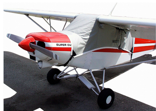
Piper PA-18 Super Cub Canopy Cover