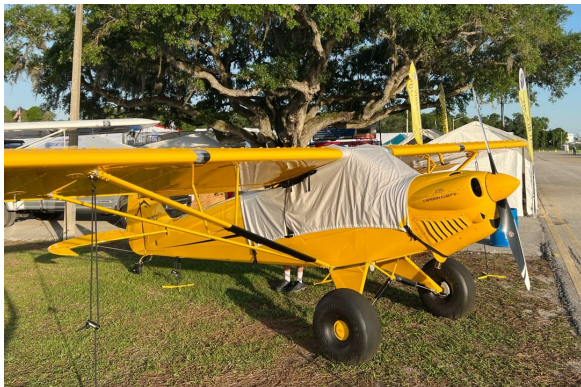
Cub Crafters CC-18 Canopy Cover

This cover type is made from Silver Acrylic Sunbrella canvas and is 100% lined with a soft and smooth microfiber. Bruce's Custom Covers developed this material combination especially for aircraft protection. The outer material is medium weight and treated for water resistance, UV resistance and anti-static buildup. The inner lining is a very soft and smooth microfiber to prevent scratching. The material is very reflective, and tests show that the cabin interior temperature can be reduced to near-ambient temperature on the hottest of days. It is water, ice and snow repellent, yet breathable to allow moisture to escape from between the cover and the aircraft surface.