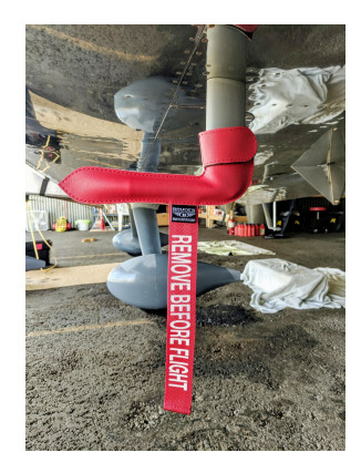
Van's RV-14 Pitot Cover

Engine Inlet Plugs are custom fit for your CubCrafters CC-11, Sport Cub S2, & Carbon Cub intakes, made with heavy-duty vinyl material, and stuffed with a single block of sculpted urethane foam. Each plug has a zipper that allows the foam to be removed and dried if necessary. Engine plugs have warning flags that are visible from the cockpit or 'remove before flight' streamers sewn onto the face of the plugs. Most plugs are imprinted with the aircraft registration number in black for an extra charge. Storage bag NOT included. Engine plugs may be inserted after flight when the engine is still warm. Engine Inlet Plugs are commonly referred to as Cowl Plugs, Intake Plugs, Cowl Blocks, Engine Blocks, and Engine Bungs.