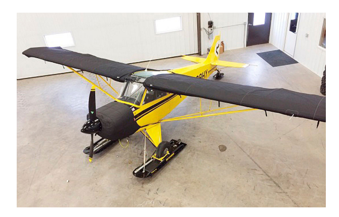
Aviat Husky Insulated Engine Cover, Wing Covers