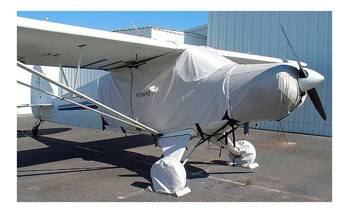
Piper PA-12 Extended Canopy, Engine & Landing Gear Covers

ALL-YEAR USE MATERIAL - Made with Silver Acrylic Sunbrella canvas, the all-year use material is the best option for sun protection and cover longevity. This heavier more durable material is intended for all weather conditions, such as rain and snow or lots of sun.