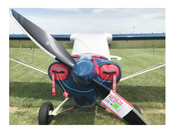
Cub Crafters EX2 Canopy Cover, Engine Plugs