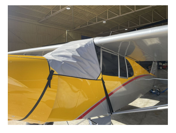
Piper PA-18 Windshield/Skylight Cover

This cover type is made from Silver Acrylic Sunbrella canvas and is 100% lined with a soft and smooth microfiber. Bruce's Custom Covers developed this material combination especially for aircraft protection. The outer material is medium weight and treated for water resistance, UV resistance and anti-static buildup. The inner lining is a very soft and smooth microfiber to prevent scratching. The material is very reflective, and tests show that the cabin interior temperature can be reduced to near-ambient temperature on the hottest of days. It is water, ice and snow repellent, yet breathable to allow moisture to escape from between the cover and the aircraft surface.