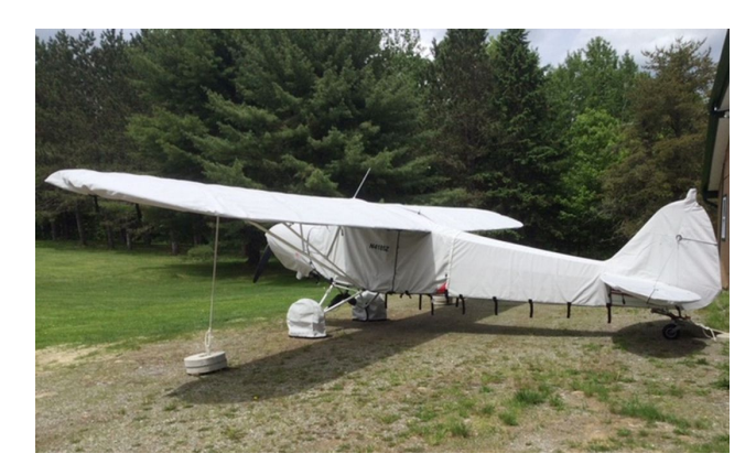
Piper PA-18-150 Super Cub Complete Cover Set

WINTER USE MATERIAL - Made with Solution-Dyed Polyester fabric, this option is intended for seasonal use to aid in deicing, rain mitigation, or for occasional travel. The material is lighter and more compact, but more susceptible to UV damage and may have a shorter useful life if used continuously outside than the all-year use material.