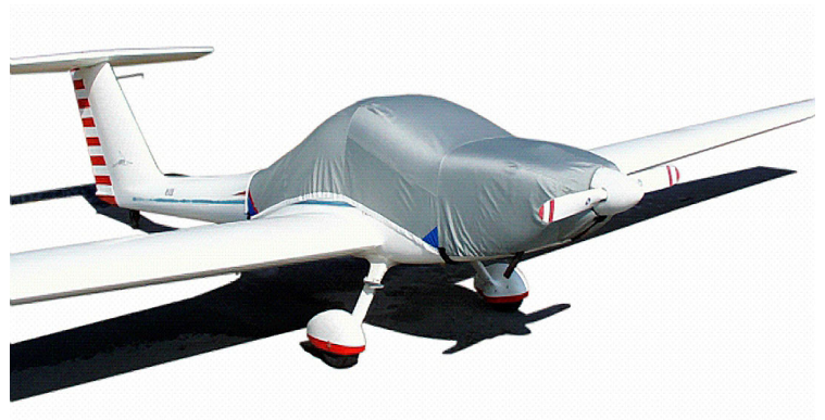
Grob 109 Canopy/Engine Cover