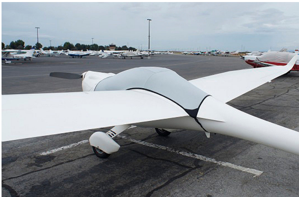
Lambda Canopy/Engine Cover and Wing Covers