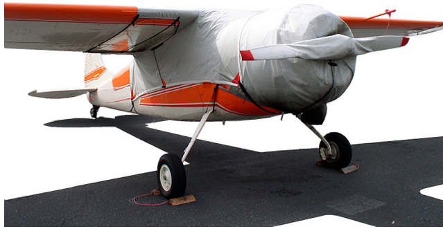
Cessna 195 Over-Top Canopy, Engine & Prop Covers