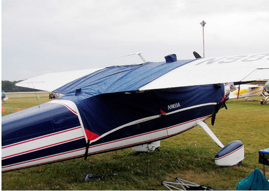
Cessna 195 Canopy Cover, extended forward and over gas caps

The material is very reflective, and tests show that the cabin interior temperature can be reduced to near-ambient temperature on the hottest of days. It is water, ice and snow repellent, yet breathable to allow moisture to escape from between the cover and the aircraft surface.