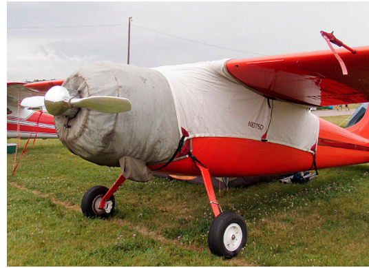
Cessna 195 Over-Top Canopy Cover & Engine Cover