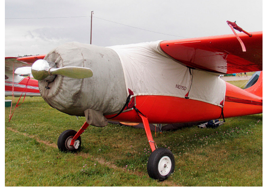
Cessna 195 Over-Top Canopy Cover & Engine Cover