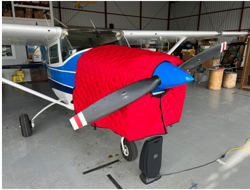
Insulated Hangar Blanket on Cessna 182

water resistance, UV resistance and anti-static buildup. The inner lining is a very soft and smooth microfiber to prevent scratching. The material is very reflective, and tests show that the cabin interior temperature can be reduced to near-ambient temperature on the hottest of days. It is water, ice and snow repellent, yet breathable to allow moisture to escape from between the cover and the aircraft surface.