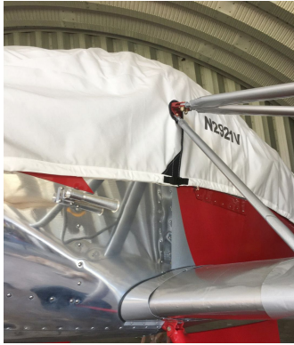
Callair A-2 Canopy Cover

Canopy Covers are commonly referred to as Cabin Covers, Fuselage Covers, Canvas Covers, Canopy Caps, etc.