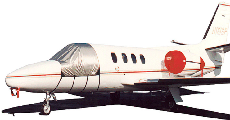
Cessna Citation I Windshield, Pitot and Engine Covers

This cover type is made from Silver Acrylic Sunbrella canvas and is 100% lined with a soft and smooth microfiber. Bruce's Custom Covers developed this material combination especially for aircraft protection. The outer material is medium weight and treated for water resistance, UV resistance and anti-static buildup. The inner lining is a very soft and smooth microfiber to prevent scratching. The material is very reflective, and tests show that the cabin interior temperature can be reduced to near-ambient temperature on the hottest of days. It is water, ice and snow repellent, yet breathable to allow moisture to escape from between the cover and the aircraft surface.