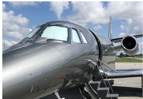
Cessna Citation 560XL Cockpit HeatShields