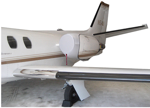
Cessna Citation "Bikini" Type Engine Covers: Extremely Light & Portable