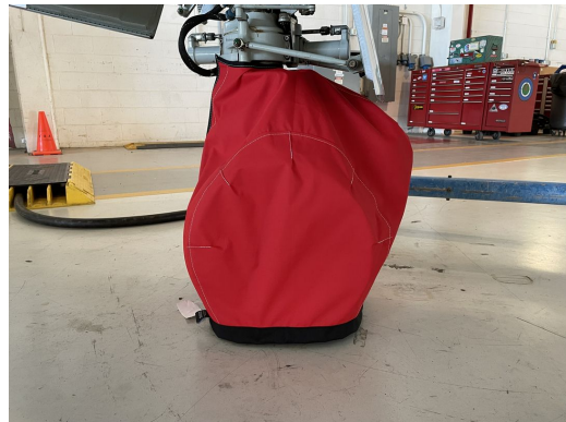
Canadair Challenger 605 Nose Gear Tire Cover