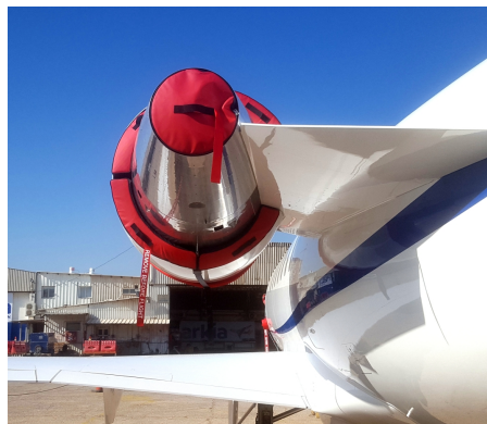
Canadair Challenger 604, 605, 650, 850 Exhaust Plugs