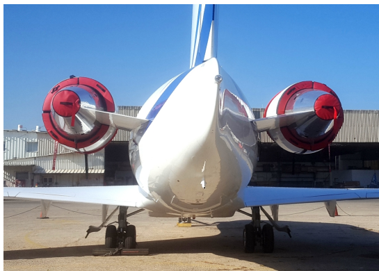
Canadair Challenger 604, 605, 650, 850 Exhaust Plugs

with the aircraft registration number in black for an extra charge. Storage bag NOT included. Engine plugs may be inserted after flight when the engine is still warm. Engine Inlet Plugs are commonly referred to as Cowl Plugs, Intake Plugs, Cowl Blocks, Engine Blocks, and Engine Bungs.