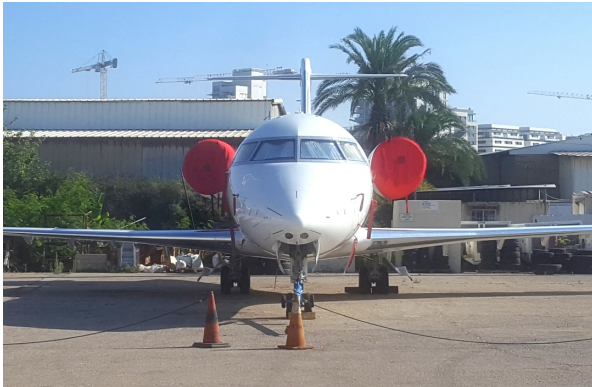
Canadair Challenger 604, 605, 650, 850 Intake Covers

The Canadair Challenger 604, 605, 650, 850 Intake Covers are designed to install easily yet be completely storable. A spring steel hoop is sewn into the hem of each cover, allowing them to be installed without climbing onto the wing or using a stepladder. To store the covers the spring steel hoop folds like a band-saw blade into three nesting rings. Each cover folds into a compact circular bundle which is stored in the included duffel bag, yet they unfold quickly for use. The Tri-Fold Ring cover is made of medium weight nylon which is available in a variety of colors to match the paint trim. Each cover set comes complete with installation and folding instructions. The aircraft's registration number can be silkscreened onto the cover for an extra charge.