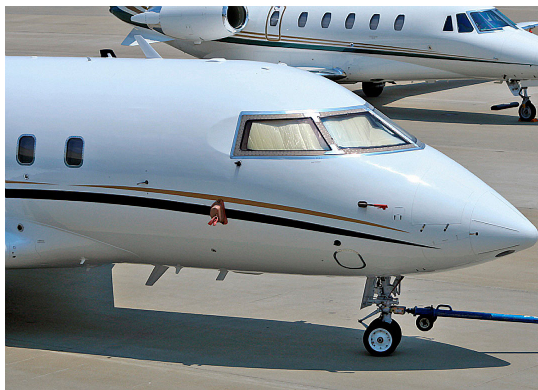
Challenger 604 Cockpit HeatShields