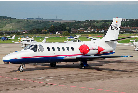
Cessna Citation II Engine Covers, Pitot Covers

The Cessna Citation II Bravo Intake/Exhaust Plugs are custom fit for the intake and exhaust openings, made with heavy-duty vinyl material, and stuffed with a single block of sculpted urethane foam. Each plug has a zipper that allows the foam to be removed and dried if necessary. Engine plugs have 'remove before flight' streamers sewn onto the face of the plugs. Most plugs are imprinted with the aircraft registration number in black. Engine plugs may be inserted after flight when the engine is still warm. Engine Inlet Plugs are commonly referred to as Cowl Plugs, Intake Plugs, Cowl Blocks, Engine Blocks, and Engine Bungs.