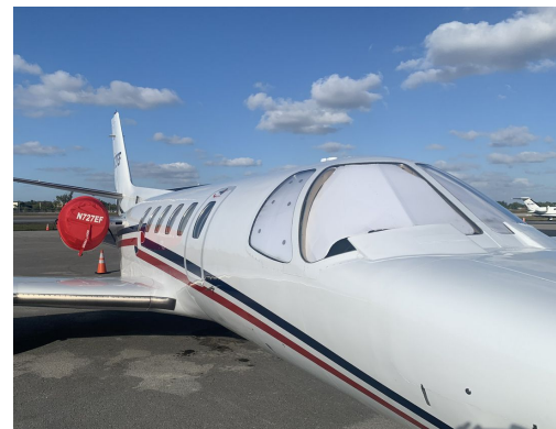
Cessna Citation S550