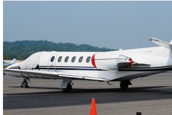
Cessna Citation S2 Cockpit Cover, Intake Covers & Exhaust Plugs