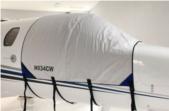
Cessna Citation M2 Cockpit Cover

This cover type is made from Silver Acrylic Sunbrella canvas and is 100% lined with a soft and smooth microfiber. Bruce's Custom Covers developed this material combination especially for aircraft protection. The outer material is medium weight and treated for water resistance, UV resistance and anti-static buildup. The inner lining is a very soft and smooth microfiber to prevent scratching. The material is very reflective, and tests show that the cabin interior temperature can be reduced to near-ambient temperature on the hottest of days. It is water, ice and snow repellent, yet breathable to allow moisture to escape from between the cover and the aircraft surface.