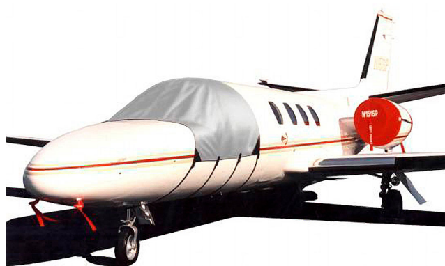
Citation Windshield Cover, Engine Cover set and Pitot Covers