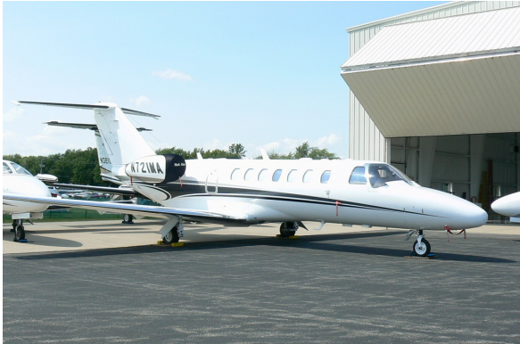
Cessna Citation CJ3 Bikini Style Engine Covers

The Cessna Citationjet V Ultra (560) Intake/Exhaust Plugs are custom fit for the intake and exhaust openings, made with heavy-duty vinyl material, and stuffed with a single block of sculpted urethane foam. Each plug has a zipper that allows the foam to be removed and dried if necessary. Engine plugs have 'remove before flight' streamers sewn onto the face of the plugs. Most plugs are imprinted with the aircraft registration number in black. Engine plugs may be inserted after flight when the engine is still warm. Engine Inlet Plugs are commonly referred to as Cowl Plugs, Intake Plugs, Cowl Blocks, Engine Blocks, and Engine Bungs.