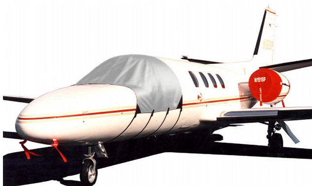
Cessna Citationjet 525B Travel Weight Cockpit/Nose Cover Cessna Citation Windshield Cover, Engine Cover set and Pitot Covers