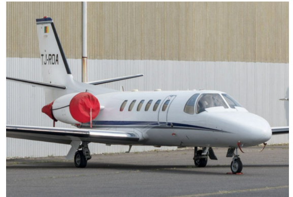
Cessna Citation II Bravo Engine Covers