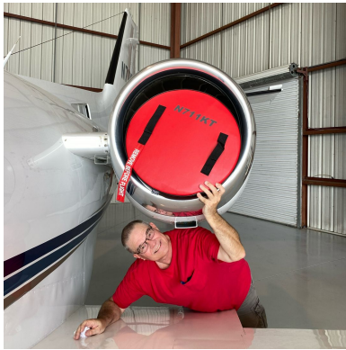
Citation II Engine Plugs

The Engine Inlet Plugs are custom fit for your Cessna Citation II (550, 551, UC-35A, with JT15D) intakes, made with heavy-duty vinyl material, and stuffed with a single block of sculpted urethane foam. Each plug has a zipper that allows the foam to be removed and dried if necessary. Engine plugs have 'remove before flight' streamers sewn onto the face of the plugs. Most plugs are imprinted with the aircraft registration number in black for an extra charge. Storage bag NOT included. Engine plugs may be inserted after flight when the engine is still warm. Engine Inlet Plugs are commonly referred to as Cowl Plugs, Intake Plugs, Cowl Blocks, Engine Blocks, and Engine Bungs.