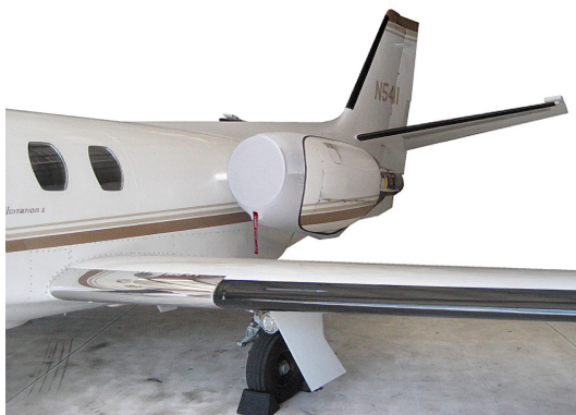
Cessna Citation "Bikini" Type Engine Covers: Extremely Light & Portable

The Cessna Citation II (550, 551, UC-35A, with JT15D) Intake Covers are designed to install easily yet be completely storable. A spring steel hoop is sewn into the hem of each cover, allowing them to be installed without climbing onto the wing or using a stepladder. To store the covers the spring steel hoop folds like a band-saw blade into three nesting rings. Each cover folds into a compact circular bundle which is stored in the included duffle bag, yet they unfold quickly for use. The Tri-Fold Ring cover is made of medium weight nylon which is available in a variety of colors to match the paint trim. Each cover set comes complete with installation and folding instructions. The aircraft's registration number can be silkscreened onto the cover for an extra charge.