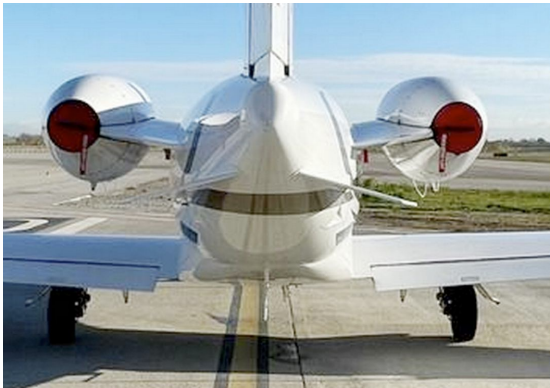
Cessna Mustang Exhaust Plugs

The Cessna Mustang 510 Intake/Exhaust Plugs are custom fit for the intake and exhaust openings, made with heavy-duty vinyl material, and stuffed with a single block of sculpted urethane foam. Each plug has a zipper that allows the foam to be removed and dried if necessary. Engine plugs have 'remove before flight' streamers sewn onto the face of the plugs. Most plugs are imprinted with the aircraft registration number in black. Engine plugs may be inserted after flight when the engine is still warm. Engine Inlet Plugs are commonly referred to as Cowl Plugs, Intake Plugs, Cowl Blocks, Engine Blocks, and Engine Bungs.