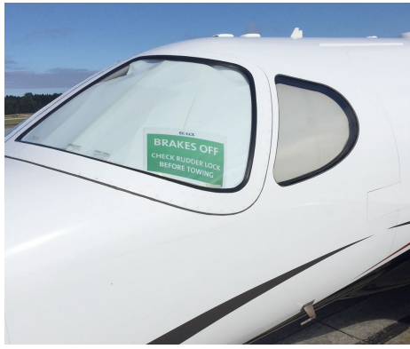
Cessna Mustang 510 Cockpit Heatshields