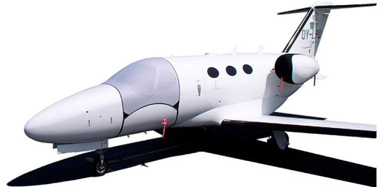
Citation Mustang Cockpit/Door/Nose Cover, Engine Inlet Cover Citation Mustang Light Weight Travel Windshield Cover, "Bikini" type Engine Cover Set