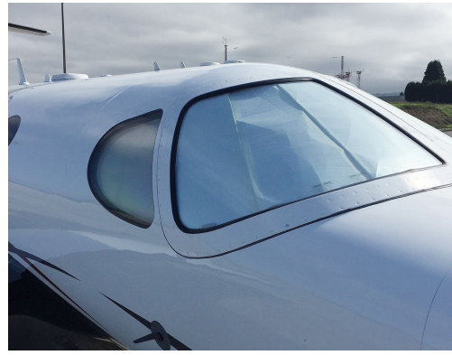
Cessna Mustang 510 Cockpit Heatshields