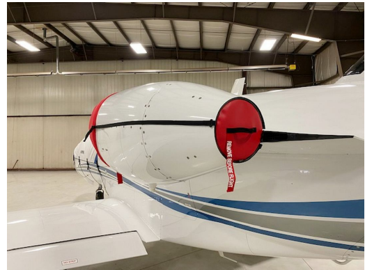
Cessna 510 Engine Inlet Covers & Exhaust Plugs