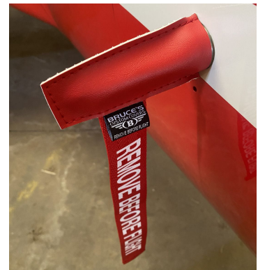
Cessna 501 Angle of Attack Transducer Cover