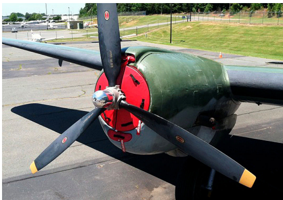
C-46 Radial Engine Intake Plug

Engine Inlet Plugs are custom fit for your Curtiss Wright C-46 Commando intakes, made with heavy-duty vinyl material, and stuffed with a single block of sculpted urethane foam. Each plug has a zipper that allows the foam to be removed and dried if necessary. Engine plugs have warning flags that are visible from the cockpit or 'remove before flight' streamers sewn onto the face of the plugs. Most plugs are imprinted with the aircraft registration number in black for an extra charge. Storage bag NOT included. Engine plugs may be inserted after flight when the engine is still warm. Engine Inlet Plugs are commonly referred to as Cowl Plugs, Intake Plugs, Cowl Blocks, Engine Blocks, and Engine Bunges.