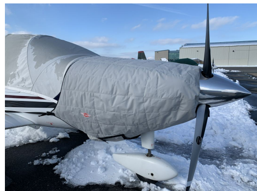
Cessna Corvalis Insulated Engine Cover