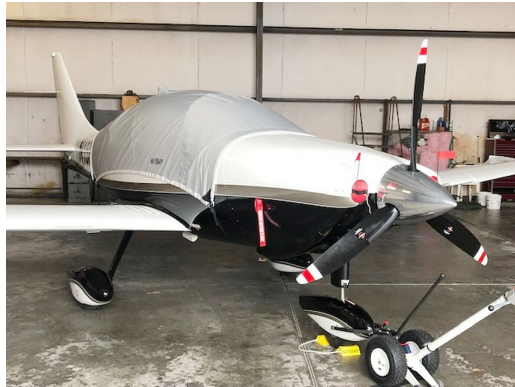
Columbia 350 Travel Cover, Engine Plugs

Travel Covers are made with Silver Solution-Dyed Polyester fabric and only lined over the windshield to save weight. The material is lightweight and more compact for easy stowage in the aircraft. The polyester material is water resistant, but only intended for occasional use outside. We also have an ultra lightweight material available for fitted hangar dust covers. For daily outdoor use, the non-travel Sunbrella Cover is the best choice.