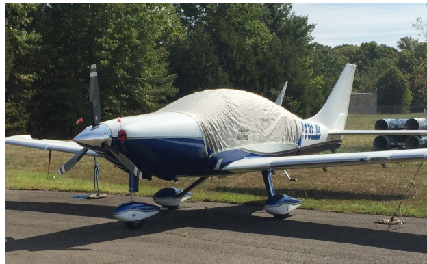
Lancair Columbia 350 Canopy Cover