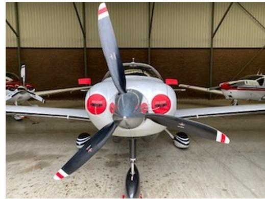
Cessna TTX T240 Engine Inlet Plugs