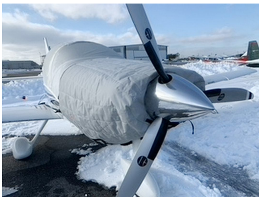
Cessna Corvalis Insulated Engine Cover

This cover type is made from Silver Acrylic Sunbrella canvas and is 100% lined with a soft and smooth microfiber. Bruce's Custom Covers developed this material combination especially for aircraft protection. The outer material is medium weight and treated for water resistance, UV resistance and anti-static buildup. The inner lining is a very soft and smooth microfiber to prevent scratching. The material is very reflective, and tests show that the cabin interior temperature can be reduced to near-ambient temperature on the hottest of days. It is water, ice and snow repellent, yet breathable to allow moisture to escape from between the cover and the aircraft surface.