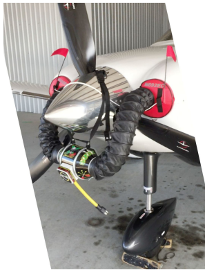
TTx Plugs for Aerotherm Preheater

Engine Inlet Plugs are custom fit for your Cessna Corvalis, Corvalis TT, Models T240, 350 & 400 intakes, made with heavy-duty vinyl material, and stuffed with a single block of sculpted urethane foam. Each plug has a zipper that allows the foam to be removed and dried if necessary. Engine plugs have warning flags that are visible from the cockpit or 'remove before flight' streamers sewn onto the face of the plugs. Most plugs are imprinted with the aircraft registration number in black for an extra charge. Storage bag NOT included. Engine plugs may be inserted after flight when the engine is still warm. Engine Inlet Plugs are commonly referred to as Cowl Plugs, Intake Plugs, Cowl Blocks, Engine Blocks, and Engine Bung s. Designed to prevent damage to the aircraft extremities in crowded hangars, these products are made of bright red Naugahyde and thickly padded with a sandwich of closed cell foam.