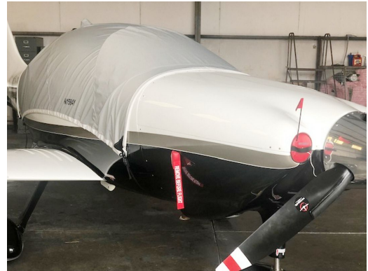
Columbia 350 Travel Cover, Engine Plugs