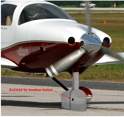
Nose Wheelpant/Strut Cover (illustration)

protection and cover longevity. This heavier more durable material is intended for all weather conditions, such as rain and snow or lots of sun.