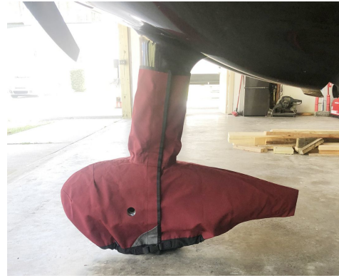
Cessna Corvalis, Lancair Columbia Wheelpant & Strut Cover