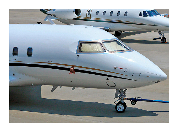
Challenger 604 Cockpit HeatShields