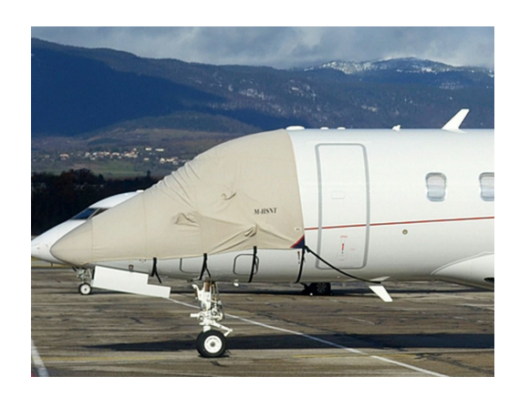
Challenger 300 Cockpit/Nose Cover

This cover type is made from Silver Acrylic Sunbrella canvas and is 100% lined with a soft and smooth microfiber. Bruce's Custom Covers developed this material combination especially for aircraft protection. The outer material is medium weight and treated for water resistance, UV resistance and anti-static buildup. The inner lining is a very soft and smooth microfiber to prevent scratching. The material is very reflective, and tests show that the cabin interior temperature can be reduced to near-ambient temperature on the hottest of days. It is water, ice and snow repellent, yet breathable to allow moisture to escape from between the cover and the aircraft surface.