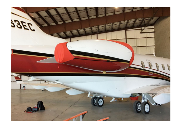
Intake/Exhaust Covers, 3-Strap Type. Successfully installed by two crew, Canadair Challenger 300 Intake/Exhaust Covers, 3-Strap one ladder. Type