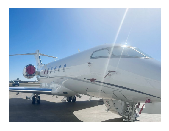
Canadair Challenger 300 Cockpit HeatShields, Intake Plugs