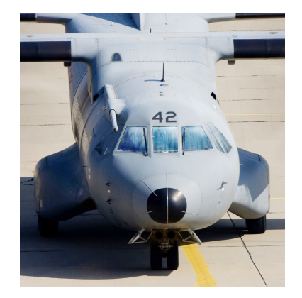
Casa C-295 Cockpit HeatShields (illustration)

This cover type is made from Silver Acrylic Sunbrella canvas and is 100% lined with a soft and smooth microfiber. Bruce's Custom Covers developed this material combination especially for aircraft protection. The outer material is medium weight and treated for water resistance, UV resistance and anti-static buildup. The inner lining is a very soft and smooth microfiber to prevent scratching. The material is very reflective, and tests show that the cabin interior temperature can be reduced to near-ambient temperature on the hottest of days. It is water, ice and snow repellent, yet breathable to allow moisture to escape from between the cover and the aircraft surface.