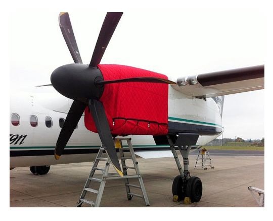
Dash 8-Q400 Insulated Engine Cover