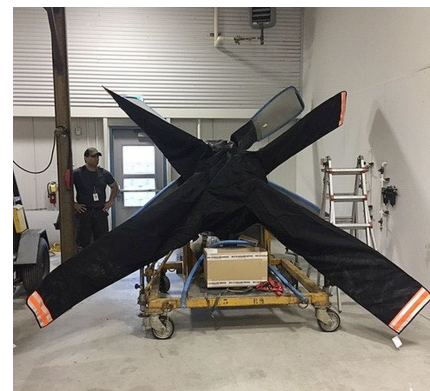
C-130 Propellor/Spinner Cover