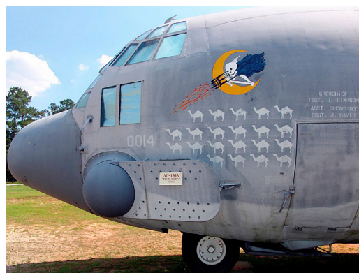
Lockheed AC-130A Flight Deck HeatShield Set