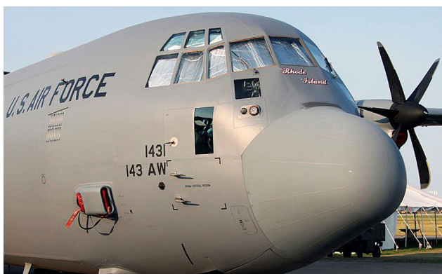
C-130 Cockpit HeatShields

Windshield and Skylight Heatshields are interior sunshades for an aircraft's front windshield and overhead window. The product is a unique composite of closed-cell foam with a silver mylar finish. The semi-rigid design is stiff enough to stand along the inside of the windshield using sun visors or window framing. It folds up flat and easily stores in the included storage sleeve. Some designs may require velcro and suction cups or split right and left sides. A Heatshield is an excellent short-term remedy for cockpit overheating. An external fabric cover is far more effective and practical for long-term protection.