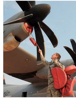
C-130 Engine and Oil Cooler inlet plugs