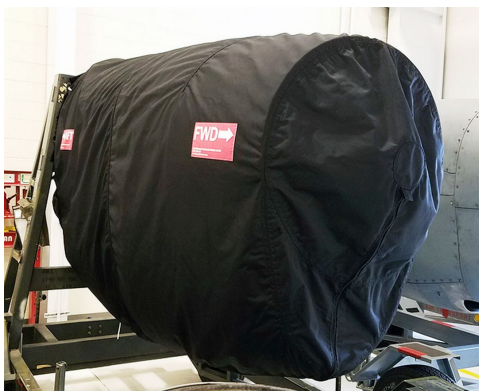
C-130 QEC / Maintenance Cover Set

This cover type is made from Silver Acrylic Sunbrella canvas and is 100% lined with a soft and smooth microfiber. Bruce's Custom Covers developed this material combination especially for aircraft protection. The outer material is medium weight and treated for water resistance, UV resistance and anti-static buildup. The inner lining is a very soft and smooth microfiber to prevent scratching. The material is very reflective, and tests show that the cabin interior temperature can be reduced to near-ambient temperature on the hottest of days. It is water, ice and snow repellent, yet breathable to allow moisture to escape from between the cover and the aircraft surface.