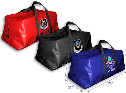
C-130 Plug Set Storage Bag