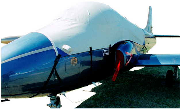
Covers & Plugs for the Jet Provost

Travel Covers are made with Silver Solution-Dyed Polyester fabric and only lined over the windshield to save weight. The material is lightweight and more compact for easy stowage in the aircraft. The polyester material is water resistant, but only intended for occasional use outside. We also have an ultra lightweight material available for fitted hangar dust covers. For daily outdoor use, the non-travel Sunbrella Cover is the best choice.