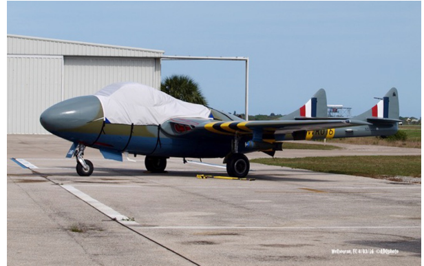
DeHavilland Vampire Canopy Cover