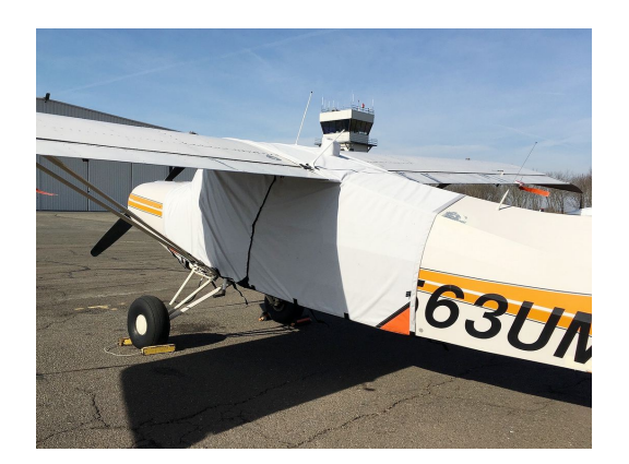
Maule M-5-235C Extended Canopy Cover