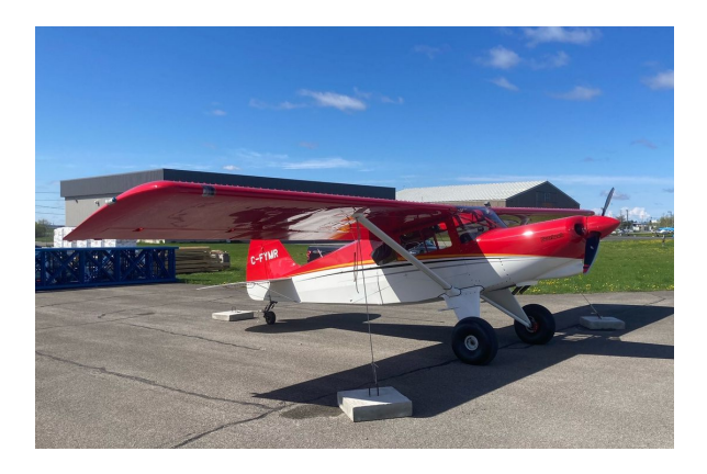
Bearhawk 4-Place Complete Cover Set, BEFORE