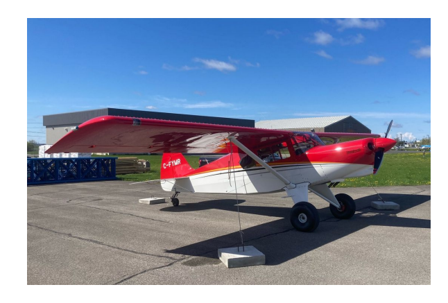
Bearhawk 4-Place Complete Cover Set, BEFORE

WINTER USE MATERIAL - Made with Solution-Dyed Polyester fabric, this option is intended for seasonal use to aid in deicing, rain mitigation, or for occasional travel. The material is lighter and more compact, but more susceptible to UV damage and may have a shorter useful life if used continuously outside than the all-year use material.