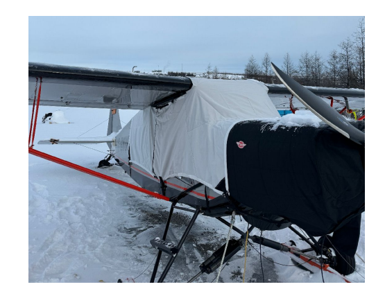
Bushmaster Canopy & Insulated Engine Covers