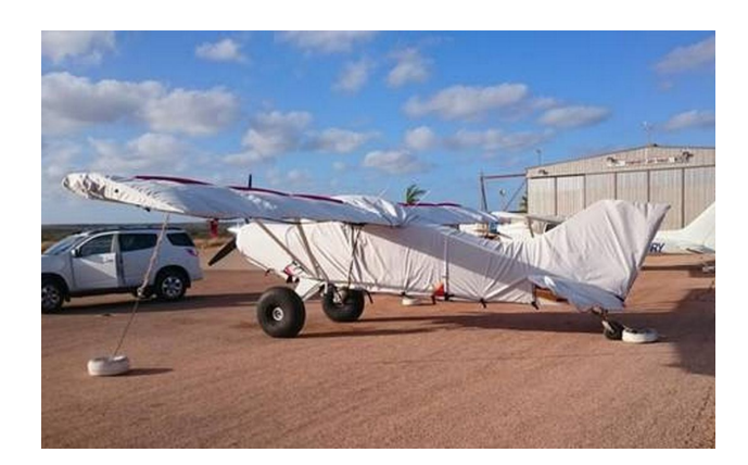
Maule M7-235 Extended Canopy, Wing, Engine & Empennage Covers

This cover type is made from Silver Acrylic Sunbrella canvas and is 100% lined with a soft and smooth microfiber. Bruce's Custom Covers developed this material combination especially for aircraft protection. The outer material is medium weight and treated for water resistance, UV resistance and anti-static buildup. The inner lining is a very soft and smooth microfiber to prevent scratching. The material is very reflective, and tests show that the cabin interior temperature can be reduced to near-ambient temperature on the hottest of days. It is water, ice and snow repellent, yet breathable to allow moisture to escape from between the cover and the aircraft surface.