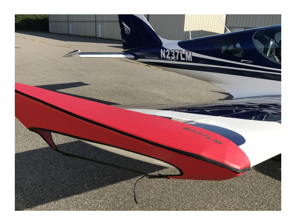
BRM Aero Bristell S-LSA Wingtip Pads