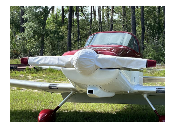
Mustang 2 Prop/Spinner Cover

This cover type is made from Silver Acrylic Sunbrella canvas and is 100% lined with a soft and smooth microfiber. Bruce's Custom Covers developed this material combination especially for aircraft protection. The outer material is medium weight and treated for water resistance, UV resistance and anti-static buildup. The inner lining is a very soft and smooth microfiber to prevent scratching. The material is very reflective, and tests show that the cabin interior temperature can be reduced to near-ambient temperature on the hottest of days. It is water, ice and snow repellent, yet breathable to allow moisture to escape from between the cover and the aircraft surface.