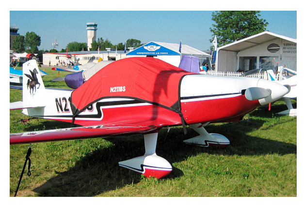
Bushby Mustang Canopy Cover

Travel Covers are made with Silver Solution-Dyed Polyester fabric and only lined over the windshield to save weight. The material is lightweight and more compact for easy stowage in the aircraft. The polyester material is water resistant, but only intended for occasional use outside. We also have an ultra lightweight material available for fitted hangar dust covers. For daily outdoor use, the non-travel Sunbrella Cover is the best choice.