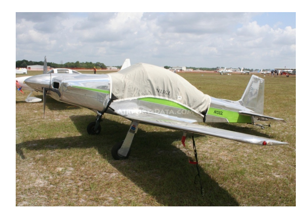
Bushby Mustang Canopy Cover