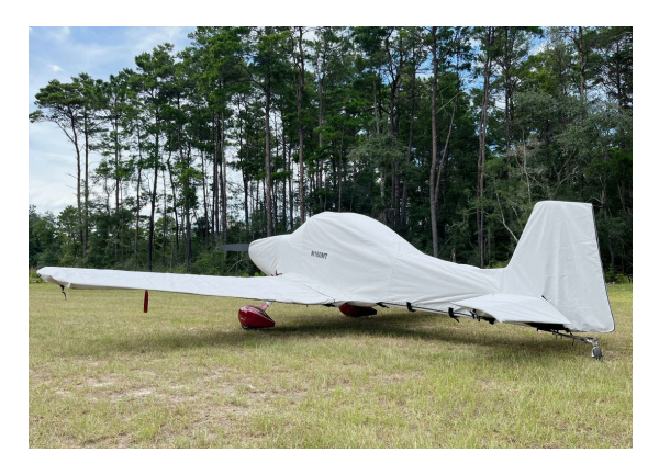
Bushby Mustang Complete Fuselage Cover with Detachable Wing Covers