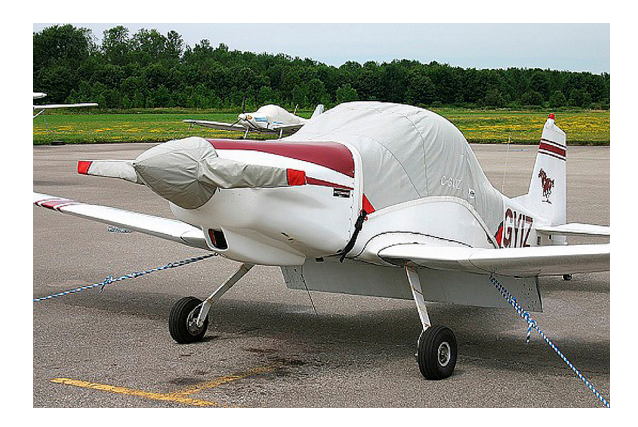
Bushby Mustang Canopy cover and Propellor/Spinner cover