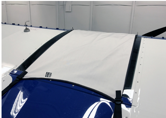
Cub Crafters CC-11 Windshild Cover

This cover type is made from Silver Acrylic Sunbrella canvas and is 100% lined with a soft and smooth microfiber. Bruce's Custom Covers developed this material combination especially for aircraft protection. The outer material is medium weight and treated for water resistance, UV resistance and anti-static buildup. The inner lining is a very soft and smooth microfiber to prevent scratching. The material is very reflective, and tests show that the cabin interior temperature can be reduced to near-ambient temperature on the hottest of days. It is water, ice and snow repellent, yet breathable to allow moisture to escape from between the cover and the aircraft surface.