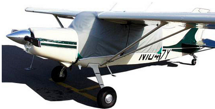
Maule M-7 Standard Canopy Cover

This cover type is made from Silver Acrylic Sunbrella canvas and is 100% lined with a soft and smooth microfiber. Bruce's Custom Covers developed this material combination especially for aircraft protection. The outer material is medium weight and treated for water resistance, UV resistance and anti-static buildup. The inner lining is a very soft and smooth microfiber to prevent scratching. The material is very reflective, and tests show that the cabin interior temperature can be reduced to near-ambient temperature on the hottest of days. It is water, ice and snow repellent, yet breathable to allow moisture to escape from between the cover and the aircraft surface.