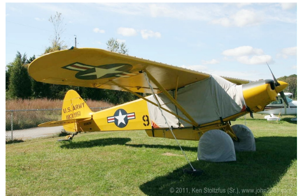
Piper L-21b Extended Canopy Cover, Tire Covers