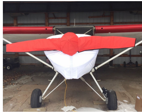
Bearhawk Engine Cover (test fit), Insulated Prop Cover