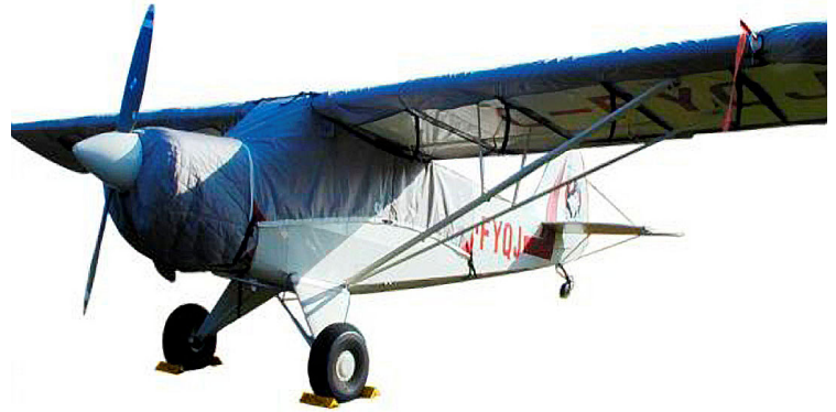
Aviat Husky Insulated Engine Cover, Canopy & Wing Covers