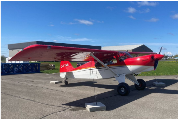
Bearhawk 4-Place Complete Cover Set, BEFORE

WINTER USE MATERIAL - Made with Solution-Dyed Polyester fabric, this option is intended for seasonal use to aid in deicing, rain mitigation, or for occasional travel. The material is lighter and more compact, but more susceptible to UV damage and may have a shorter useful life if used continuously outside than the all-year use material.