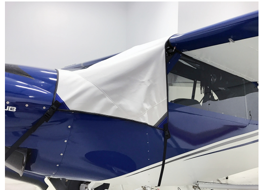
Cub Crafters CC-11 Windshild Cover