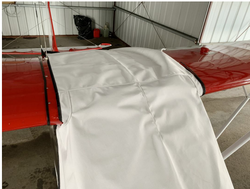
Bellanca Citabria Windshield/Skylight Cover

This cover type is made from Silver Acrylic Sunbrella canvas and is 100% lined with a soft and smooth microfiber. Bruce's Custom Covers developed this material combination especially for aircraft protection. The outer material is medium weight and treated for water resistance, UV resistance and anti-static buildup. The inner lining is a very soft and smooth microfiber to prevent scratching. The material is very reflective, and tests show that the cabin interior temperature can be reduced to near-ambient temperature on the hottest of days. It is water, ice and snow repellent, yet breathable to allow moisture to escape from between the cover and the aircraft surface.