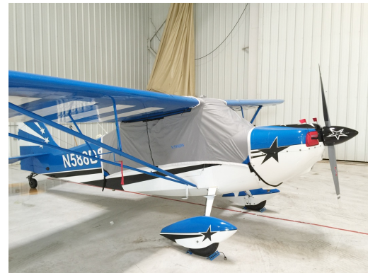
Bellanca Citabria Light Weight Travel Cover, Engine Plugs