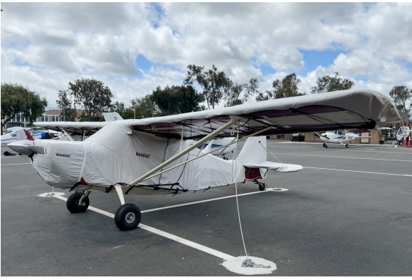
Bellanca Decathlon Full Cover Set