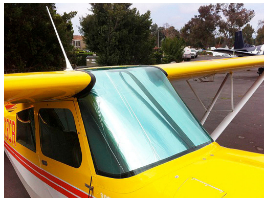
Bellanca Citabria Windshield HeatShield