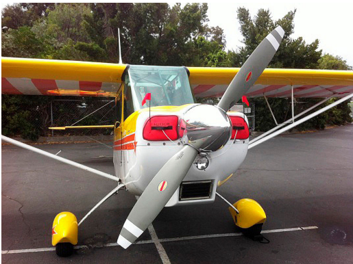
Bellanca Citabria Engine Plugs

Engine Inlet Plugs are custom fit for your Bellanca (American Champion) Decathlon intakes, made with heavy-duty vinyl material, and stuffed with a single block of sculpted urethane foam. Each plug has a zipper that allows the foam to be removed and dried if necessary. Engine plugs have warning flags that are visible from the cockpit or 'remove before flight' streamers sewn onto the face of the plugs. Most plugs are imprinted with the aircraft registration number in black for an extra charge. Storage bag NOT included. Engine plugs may be inserted after flight when the engine is still warm. Engine Inlet Plugs are commonly referred to as Cowl Plugs, Intake Plugs, Cowl Blocks, Engine Blocks, and Engine Bungs.