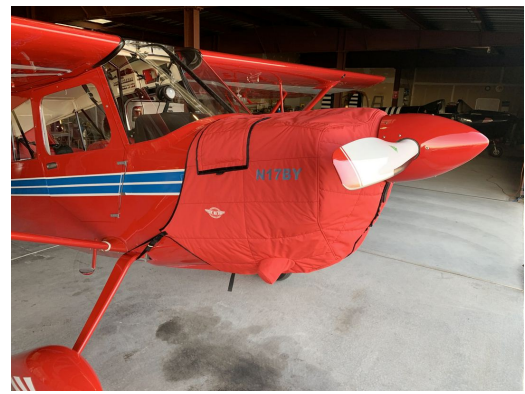
American Champion 8KCAB Insulated Engine Cover