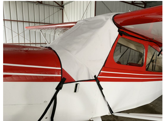
Bellanca Citabria Windshield/Skylight Cover