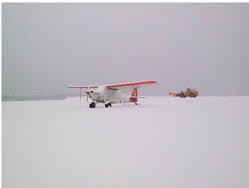
Bellanca Citabria Over-Top Canopy Cover, extended to tail

This cover type is made from Silver Acrylic Sunbrella canvas and is 100% lined with a soft and smooth microfiber. Bruce's Custom Covers developed this material combination especially for aircraft protection. The outer material is medium weight and treated for water resistance, UV resistance and anti-static buildup. The inner lining is a very soft and smooth microfiber to prevent scratching. The material is very reflective, and tests show that the cabin interior temperature can be reduced to near-ambient temperature on the hottest of days. It is water, ice and snow repellent, yet breathable to allow moisture to escape from between the cover and the aircraft surface.