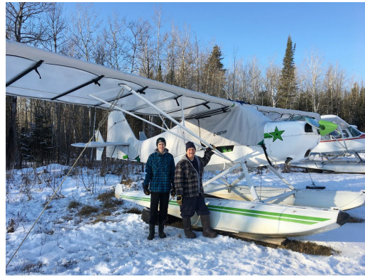
Bellanca Citabria Canopy Cover (extends to tail), Wing Covers, Empennage Covers