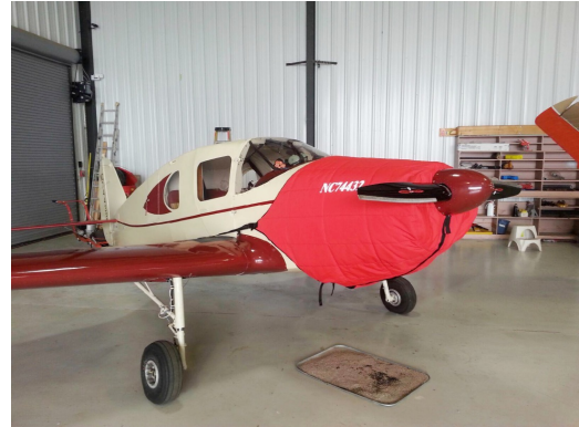
Bellanca Cruisemaster Insulated Engine Cover