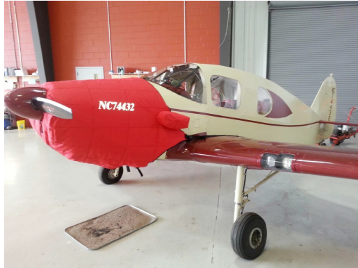
Bellanca Cruisemaster Insulated Engine Cover

This cover type is made from Silver Acrylic Sunbrella canvas and is 100% lined with a soft and smooth microfiber. Bruce's Custom Covers developed this material combination especially for aircraft protection. The outer material is medium weight and treated for water resistance, UV resistance and anti-static buildup. The inner lining is a very soft and smooth microfiber to prevent scratching. The material is very reflective, and tests show that the cabin interior temperature can be reduced to near-ambient temperature on the hottest of days. It is water, ice and snow repellent, yet breathable to allow moisture to escape from between the cover and the aircraft surface.