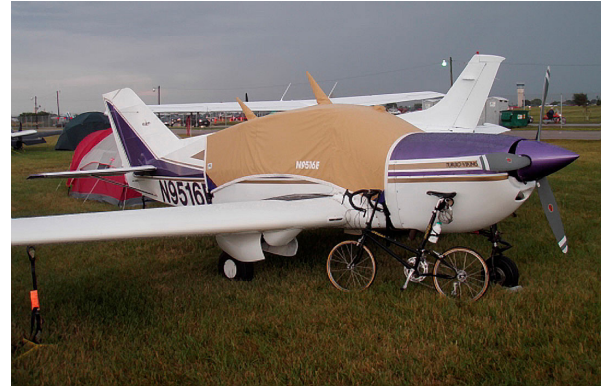
Bellanca Super Viking Canopy Cover