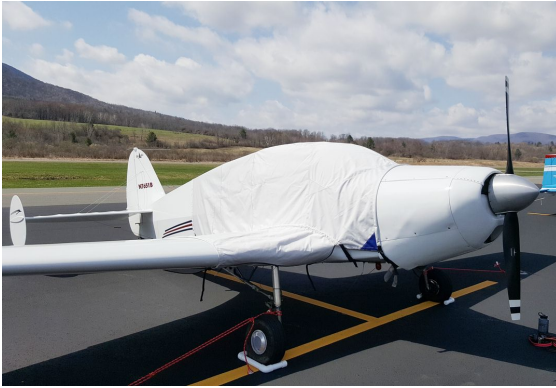
Bellanca Cruisemaster Extended Canopy Cover with 36" Wing Extensions.

This cover type is made from Silver Acrylic Sunbrella canvas and is 100% lined with a soft and smooth microfiber. Bruce's Custom Covers developed this material combination especially for aircraft protection. The outer material is medium weight and treated for water resistance, UV resistance and anti-static buildup. The inner lining is a very soft and smooth microfiber to prevent scratching. The material is very reflective, and tests show that the cabin interior temperature can be reduced to near-ambient temperature on the hottest of days. It is water, ice and snow repellent, yet breathable to allow moisture to escape from between the cover and the aircraft surface.