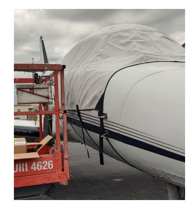
British Aerospace Jetstream 31 Cockpit Cover

This cover type is made from Silver Acrylic Sunbrella canvas and is 100% lined with a soft and smooth microfiber. Bruce's Custom Covers developed this material combination especially for aircraft protection. The outer material is medium weight and treated for water resistance, UV resistance and anti-static buildup. The inner lining is a very soft and smooth microfiber to prevent scratching. The material is very reflective, and tests show that the cabin interior temperature can be reduced to near-ambient temperature on the hottest of days. It is water, ice and snow repellent, yet breathable to allow moisture to escape from between the cover and the aircraft surface.