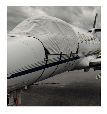
British Aerospace Jetstream 31 Cockpit Cover