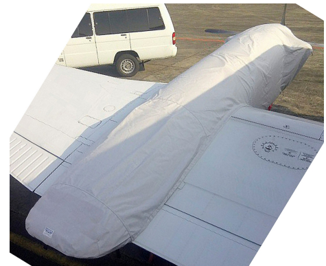
King Air 350 Engine Cover