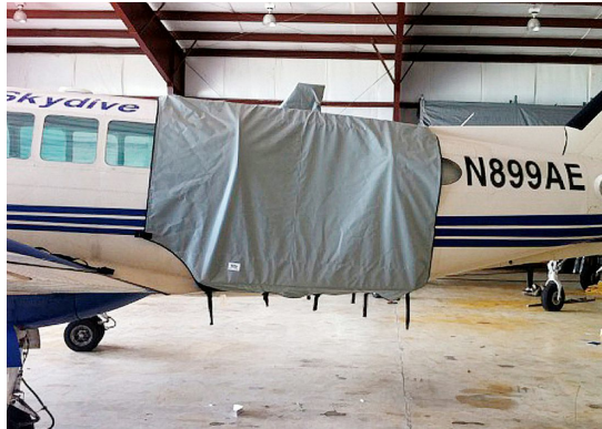
750XL Jump Door Cover