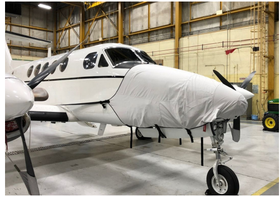
King Air 200 Nose Cover