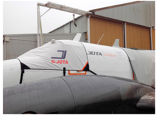
King Air Windshield/Cockpit Cover