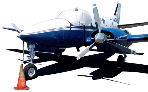
Beech King Air Windshield Cover