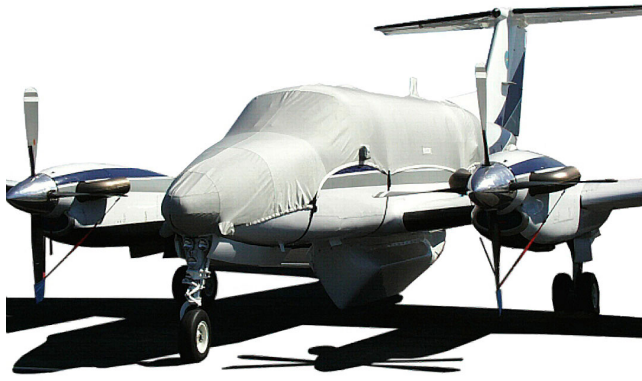
King Air Canopy/Nose Cover