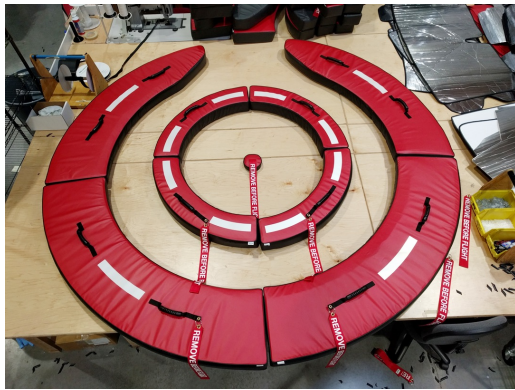
Boeing 747-8 Exhaust Plugs

The Engine Exhaust Plugs are custom fit for your Boeing 787 Dreamliner exhaust openings, made with heavy-duty vinyl material, and stuffed with a single block of sculpted urethane foam. Each plug has a zipper that allows the foam to be removed and dried if necessary. Exhaust plugs have 'remove before flight' streamers sewn onto the face of the plugs. Most plugs are imprinted with the aircraft registration number in black for an extra charge. Exhaust plugs may be inserted soon after flight when the engine is still warm. Engine Inlet Plugs are commonly referred to as Cowl Plugs, Intake Plugs, Cowl Blocks, Engine Blocks, and Engine Bungs.