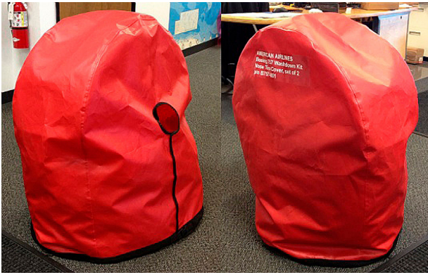
Boeing 757 Tire Covers, great for Wash Prep or Storage