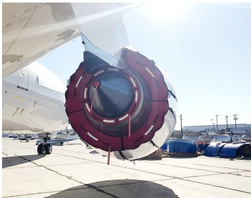
Boeing 787 Dreamliner Bypass Vent, Turbine Exhaust, & Exhaust Nozzle Plugs, Genx Engines