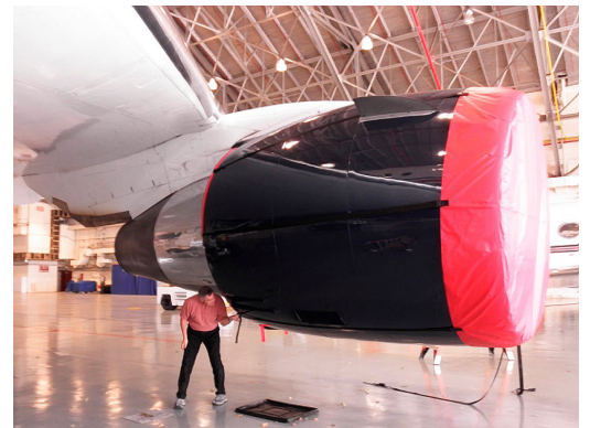
Boeing 767 Intake Covers Ship Set