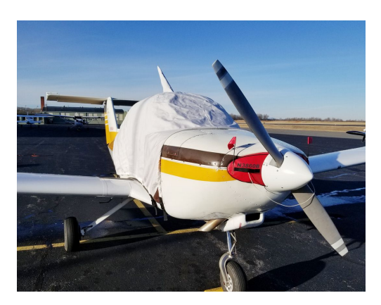
Canopy Cover for Beech Skipper