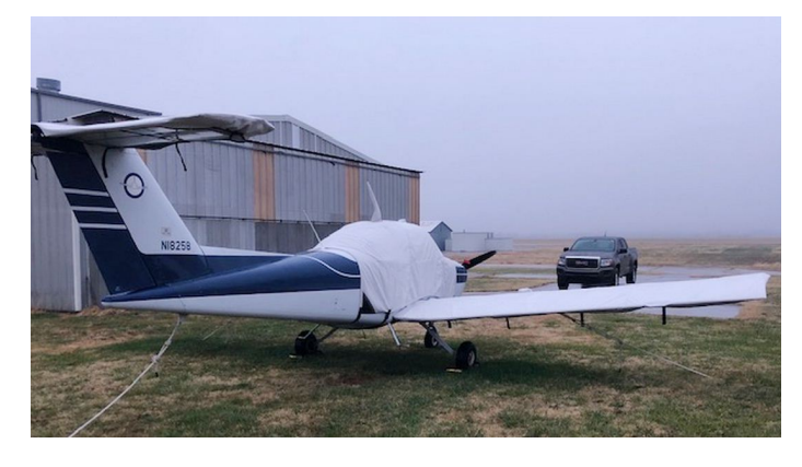
Beech Skipper Extended Canopy Cover, Wing & Horiz. Stab. Covers