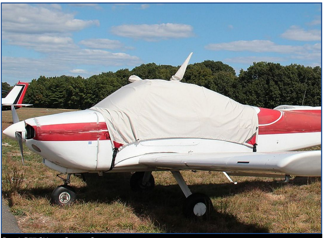
Beech B77 Skipper Canopy Cover