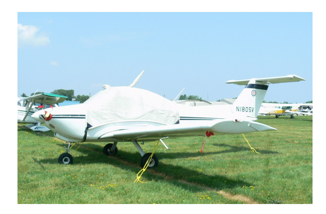
Canopy Cover for Beech Skipper