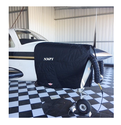
Beech Bonanza 36 Models Insulated Engine Cover