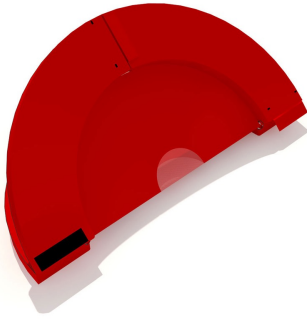
Airbus A330 Intake Plug, framed bi-fold type