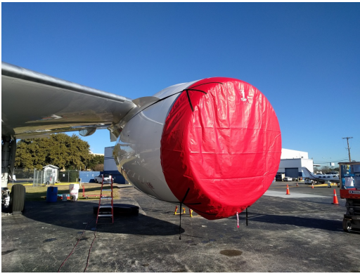
Boeing 787 Intake Cover