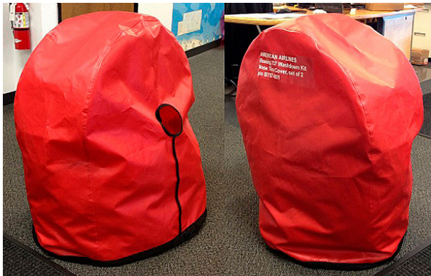
Boeing 757 Tire Covers, great for Wash Prep or Storage

ALL-YEAR USE MATERIAL - Made with Silver Acrylic Sunbrella canvas, the all-year use material is the best option for sun protection and cover longevity. This heavier more durable material is intended for all weather conditions, such as rain and snow or lots of sun.