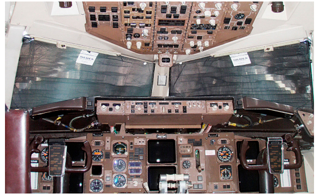
Boeing 757 Cockpit HeatShield set