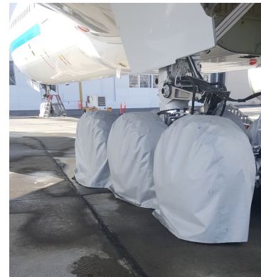
Boeing 777 Main & Nose Gear Tire Covers