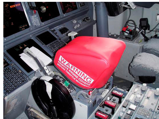
Boeing Throttle Quadrant Cover