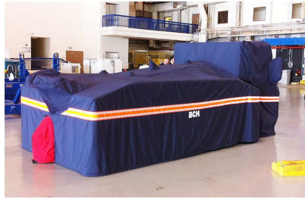
Complete Cover for Eagle Tug