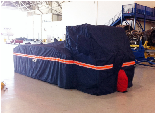
Complete Cover for Eagle Tug