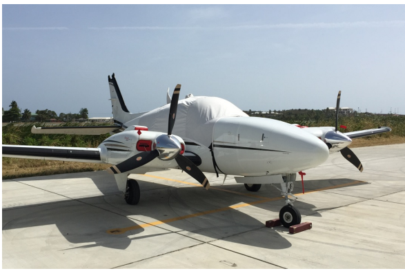
Baron 58 Canopy Cover, Engine Plugs