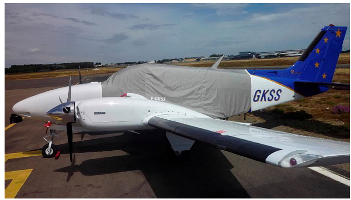
Baron Extended Canopy Cover, Pitot Cover and Cowl Top Plugs