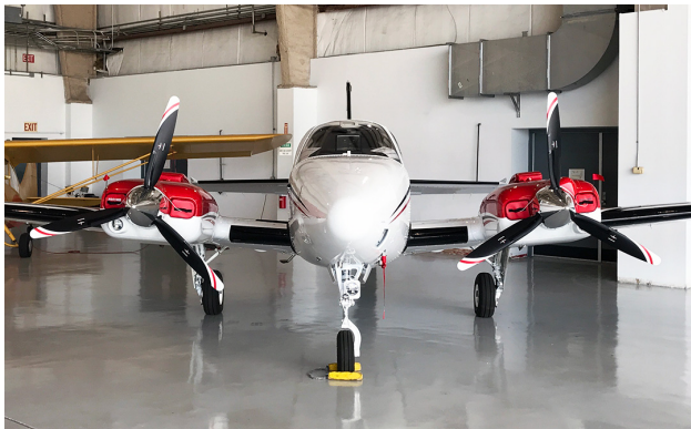
Beech Baron 58 Engine Inlet and Cowl top Plugs, With A/C (G58 Models)

Engine Inlet Plugs are custom fit for your Beech Baron 58, G58 intakes, made with heavy-duty vinyl material, and stuffed with a single block of sculpted urethane foam. Each plug has a zipper that allows the foam to be removed and dried if necessary. Engine plugs have warning flags that are visible from the cockpit or 'remove before flight' streamers sewn onto the face of the plugs. Most plugs are imprinted with the aircraft registration number in black for an extra charge. Storage bag NOT included. Engine plugs may be inserted after flight when the engine is still warm. Engine Inlet Plugs are commonly referred to as Cowl Plugs, Intake Plugs, Cowl Blocks, Engine Blocks, and Engine Bung.