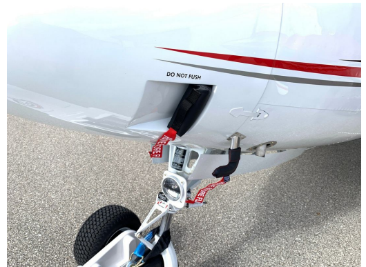
Beech Baron G58 Nose Inlet Plug