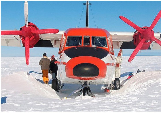
Casa 212 Insulated Engine & Propeller/Spinner Covers