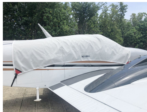
Baron G58 Travel Cover