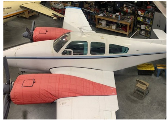
Beech Baron B55 Insulated Engine Covers