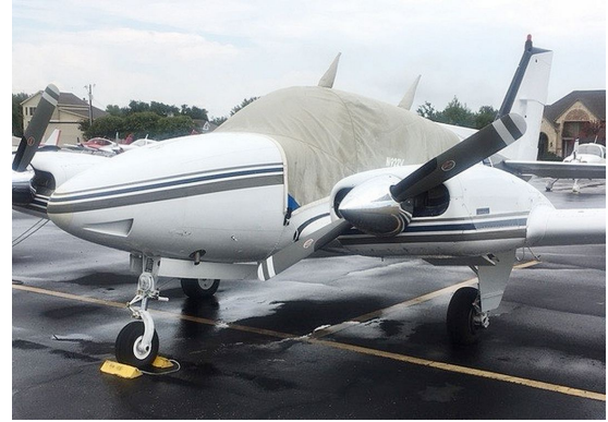
Beech Baron Canopy Cover