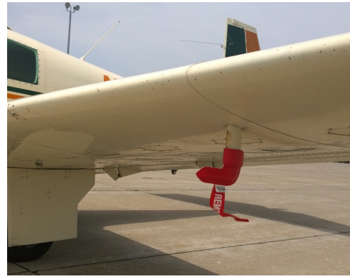
Mooney Pitot Cover