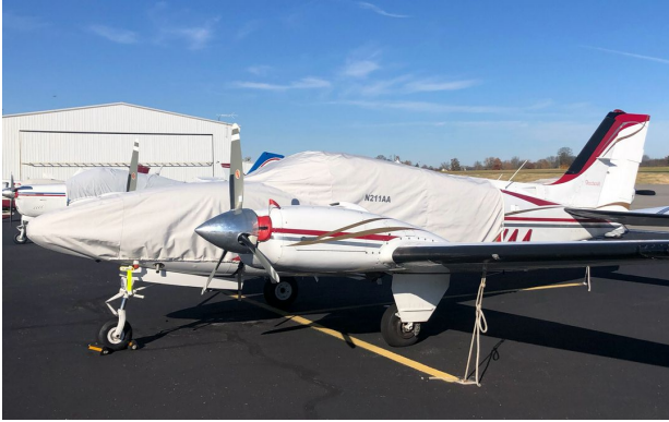
Baron Beech E-55 Extended Canopy/Nose Cover

water resistance, UV resistance and anti-static buildup. The inner lining is a very soft and smooth microfiber to prevent scratching. The material is very reflective, and tests show that the cabin interior temperature can be reduced to near-ambient temperature on the hottest of days. It is water, ice and snow repellent, yet breathable to allow moisture to escape from between the cover and the aircraft surface.