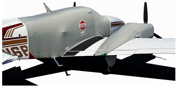
Standard Canopy Cover & Engine Plugs. Extended Canopy Cover & Engine Cover