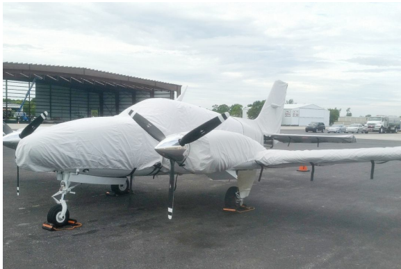
Full Cover Set (58P-020, 58P-225, 58P-405)

WINTER USE MATERIAL - Made with Solution-Dyed Polyester fabric, this option is intended for seasonal use to aid in deicing, rain mitigation, or for occasional travel. The material is lighter and more compact, but more susceptible to UV damage and may have a shorter useful life if used continuously outside than the all-year use material.