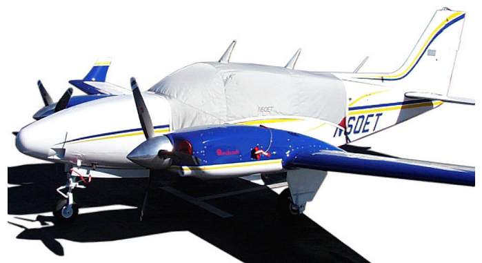
Standard Canopy Cover & Engine Plugs