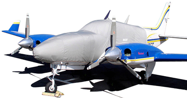
Baron Canopy/Nose Cover

Travel Covers are made with Silver Solution-Dyed Polyester fabric and only lined over the windshield to save weight. The material is lightweight and more compact for easy stowage in the aircraft. The polyester material is water resistant, but only intended for occasional use outside. We also have an ultra lightweight material available for fitted hangar dust covers. For daily outdoor use, the non-travel Sunbrella Cover is the best choice.