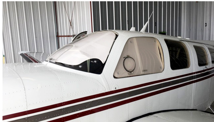
Beech Baron 58P Cockpit Heatshield Set