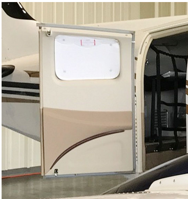
Beech Baron 58 Cabin HeatShield

Windshield Heatshields are interior sunshades for an aircraft's front windshield. The product is a unique composite of closed-cell foam with a silver mylar finish. The semi-rigid design is stiff enough to stand along the inside of the windshield using sun visors or window framing. It folds up flat and easily stores in the included storage sleeve. Some designs may require velcro and suction cups or split right and left sides. A Heatshield is an excellent short-term remedy for cockpit overheating. An external fabric cover is far more effective and practical for long-term protection.