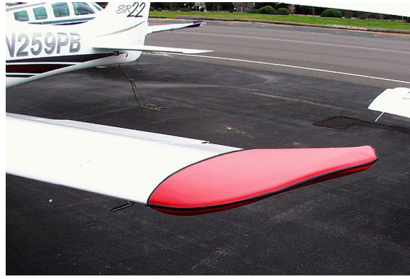
Cirrus SR-22 Wingtip Pad (also available for the Horiz. Stab.)