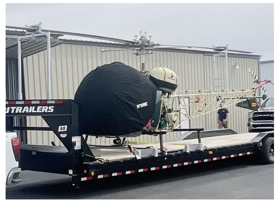
Bell 47 Bubble Cover