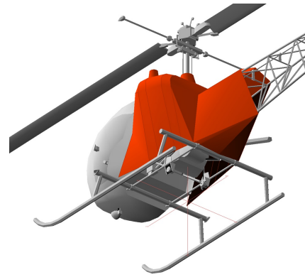
Bell 47 Engine Area Cover, 3D model