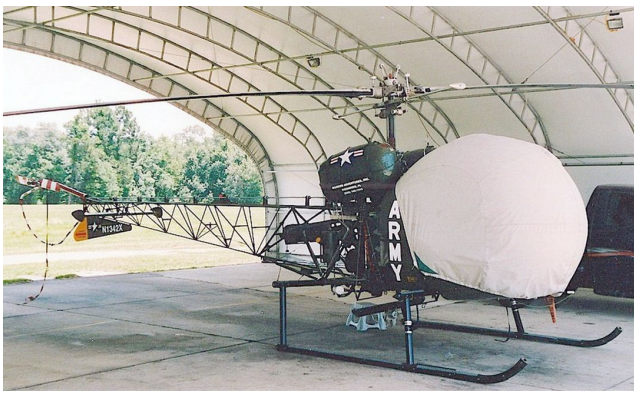
Bell 47 Bubble Cover