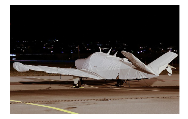
Bonanza N35 Extended Canopy, Engine, Empennage, Wing & Prop Covers