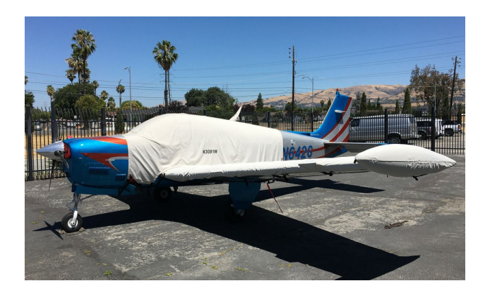
Beech Bonanza A36 Wing Covers with D'Shannon Tip Tanks, Extended Canopy Cover

Designed to prevent damage to the aircraft extremities in crowded hangars, these products are made of bright red Naugahyde and thickly padded with a sandwich of closed cell foam.