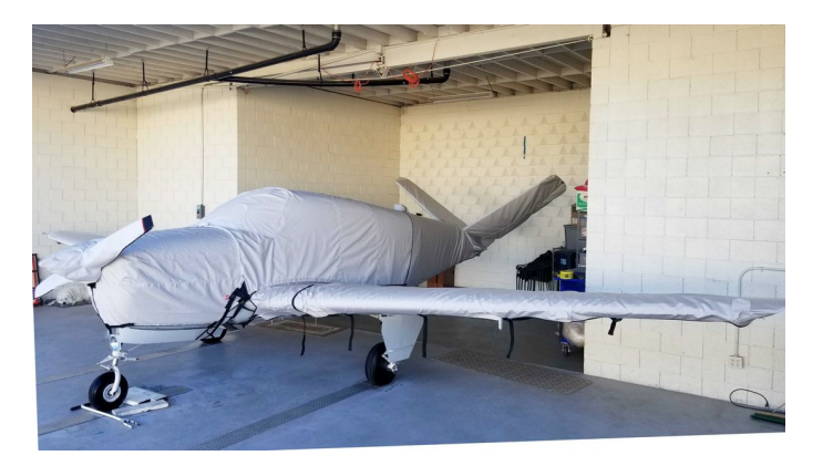
Beech Bonanza N35 Complete Cover Set

This cover type is made from Silver Acrylic Sunbrella canvas and is 100% lined with a soft and smooth microfiber. Bruce's Custom Covers developed this material combination especially for aircraft protection. The outer material is medium weight and treated for water resistance, UV resistance and anti-static buildup. The inner lining is a very soft and smooth microfiber to prevent scratching. The material is very reflective, and tests show that the cabin interior temperature can be reduced to near-ambient temperature on the hottest of days. It is water, ice and snow repellent, yet breathable to allow moisture to escape from between the cover and the aircraft surface.