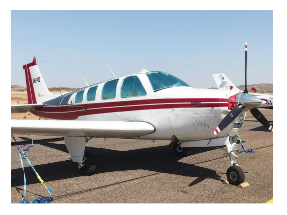
Beech A-36 Bonanza Cabin HeatShields

Windshield Heatshields are interior sunshades for an aircraft's front windshield. The product is a unique composite of closed-cell foam with a silver mylar finish. The semi-rigid design is stiff enough to stand along the inside of the windshield using sun visors or window framing. It folds up flat and easily stores in the included storage sleeve. Some designs may require velcro and suction cups or split right and left sides. A Heatshield is an excellent short-term remedy for cockpit overheating. An external fabric cover is far more effective and practical for long-term protection.