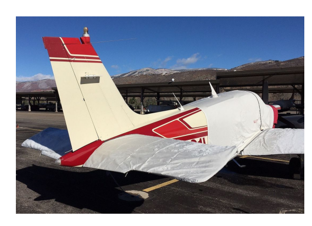
Beech Bonanza A36 Horizontal Stab, Extended Canopy, Wing Covers