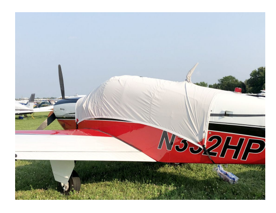
Beech Bonanza Canopy Cover

Travel Covers are made with Silver Solution-Dyed Polyester fabric and only lined over the windshield to save weight. The material is lightweight and more compact for easy stowage in the aircraft. The polyester material is water resistant, but only intended for occasional use outside. We also have an ultra lightweight material available for fitted hangar dust covers. For daily outdoor use, the non-travel Sunbrella Cover is the best choice.