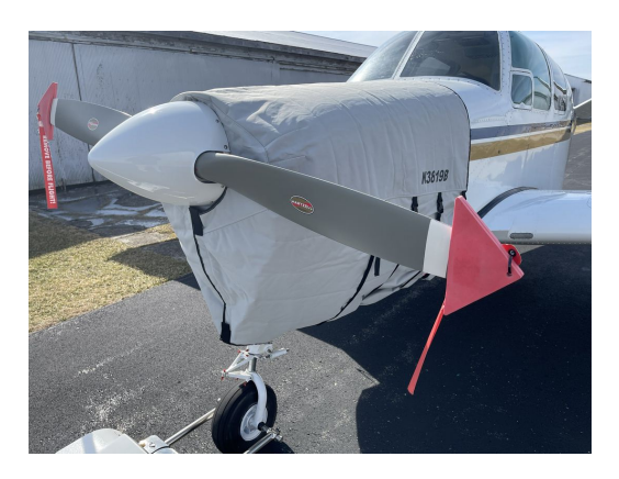
Beech Bonanza Insulated Engine Cover