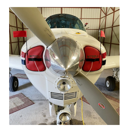
Bonanza Standard Canopy Cover & Plugs