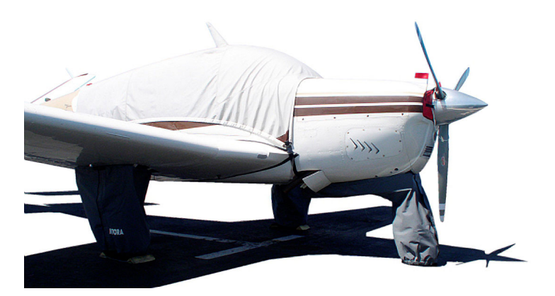
Beech Bonanza/Debonair/Baron Landing Gear Covers