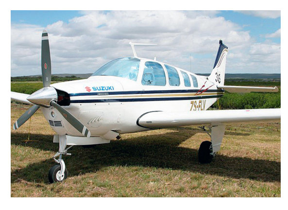
Bonanza A36 HeatShield Set