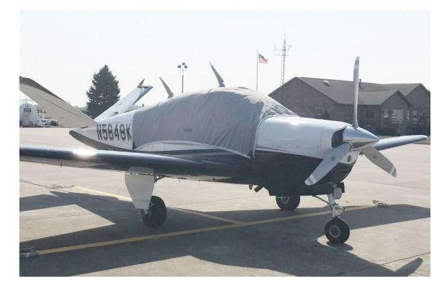
Beech Bonanza/Debonair Travel Cover, Light Weight Travel Canopy Cover