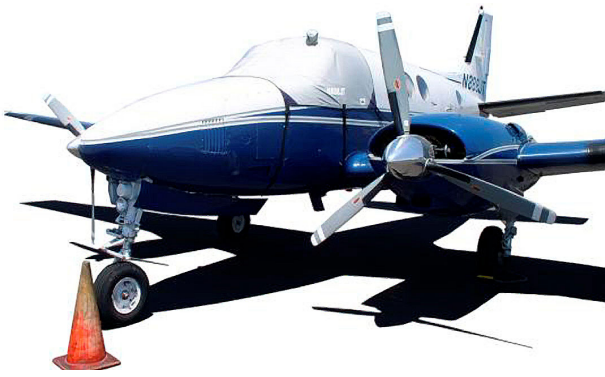
King Air Cockpit Cover, belly-strap type