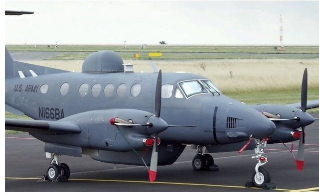
Beech King Air 300 Cockpit HeatShields, Engine Plugs, Prop Ties