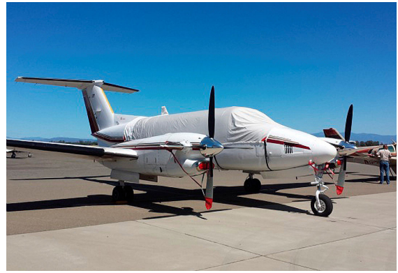
King Air 300 Canopy Cover, Engine Plugs, Prop Tie/Exhaust Covers