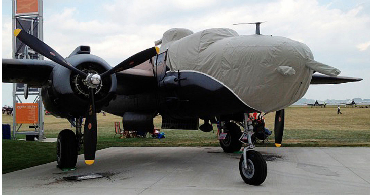
B25 Cockpit/Nose and Gun Turret Covers

This cover type is made from Silver Acrylic Sunbrella canvas and is 100% lined with a soft and smooth microfiber. Bruce's Custom Covers developed this material combination especially for aircraft protection. The outer material is medium weight and treated for water resistance, UV resistance and anti-static buildup. The inner lining is a very soft and smooth microfiber to prevent scratching. The material is very reflective, and tests show that the cabin interior temperature can be reduced to near-ambient temperature on the hottest of days. It is water, ice and snow repellent, yet breathable to allow moisture to escape from between the cover and the aircraft surface.