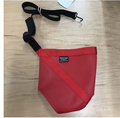
Prop Tie-Down, Various Models (secures with a hook to engine nacelle)