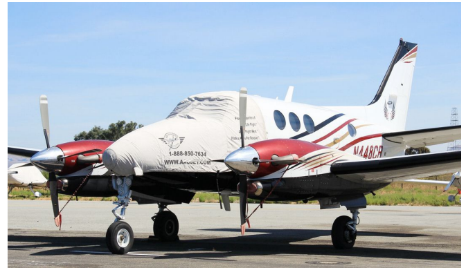
King Air Cockpit/Nose