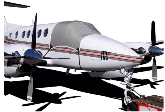
King Air 200/300 Snap-On Windshield Cover