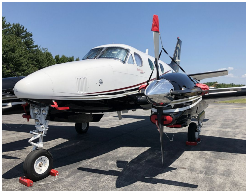
Beech C90A Prop Tie Downs/Exhaust Covers

Engine Inlet Plugs are custom fit for your Beech King Air 200, 250, 260 (C-12, RC-12, UC-12) intakes, made with heavy-duty vinyl material, and stuffed with a single block of sculpted urethane foam. Each plug has a zipper that allows the foam to be removed and dried if necessary. Engine plugs have warning flags that are visible from the cockpit or 'remove before flight' streamers sewn onto the face of the plugs. Most plugs are imprinted with the aircraft registration number in black for an extra charge. Storage bag NOT included. Engine plugs may be inserted after flight when the engine is still warm. Engine Inlet Plugs are commonly referred to as Cowl Plugs, Intake Plugs, Cowl Blocks, Engine Blocks, and Engine Bunges.