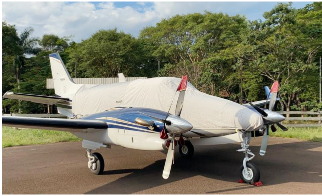
King Air C90GTi Canopy/Nose Cover