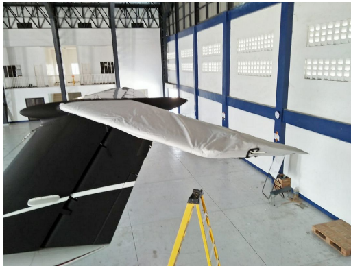
Beech King Air B350 Horizontal Stabilizer Covers

WINTER USE MATERIAL - Made with Solution-Dyed Polyester fabric, this option is intended for seasonal use to aid in deicing, rain mitigation, or for occasional travel. The material is lighter and more compact, but more susceptible to UV damage and may have a shorter useful life if used continuously outside than the all-year use material.