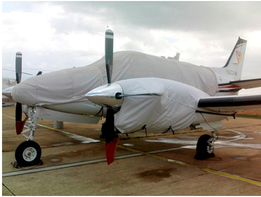
King Air C90 Canopy/Nose Cover, Engine Covers

Travel Covers are made with Silver Solution-Dyed Polyester fabric and only lined over the windshield to save weight. The material is lightweight and more compact for easy stowage in the aircraft. The polyester material is water resistant, but only intended for occasional use outside. We also have an ultra lightweight material available for fitted hangar dust covers. For daily outdoor use, the non-travel Sunbrella Cover is the best choice.