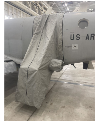
King Air Airstair Door Cover