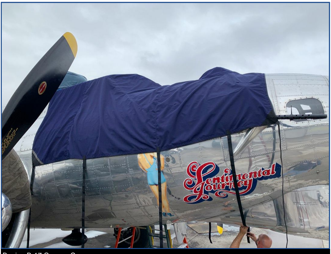
Boeing B-17 Canopy Cover