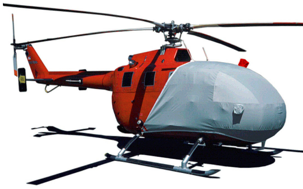
MBB BO-105 Bubble Cover