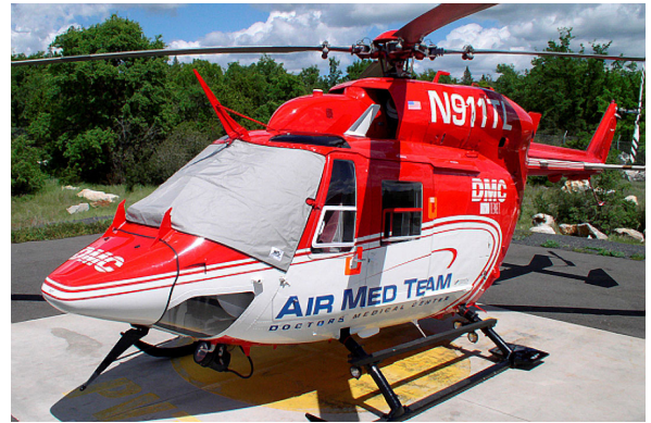
BK-117 Windshield Cover