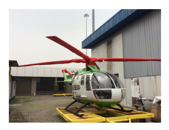
MBB BO-105 Blade, Rotor Head & Tail Rotor Covers