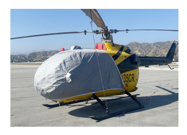
Eurocopter BO-105 Bubble Cover, Standard Model