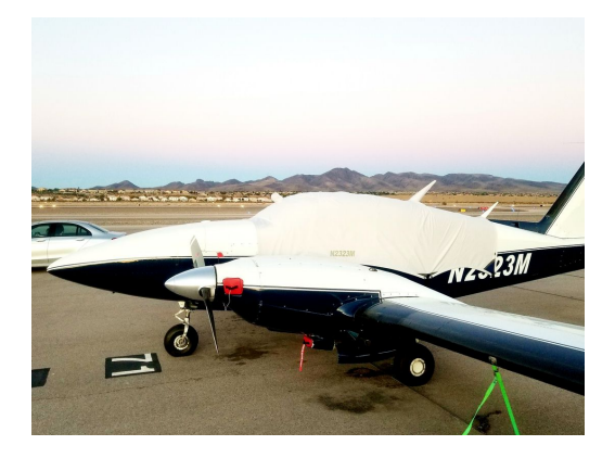
Piper Aztec Canopy Cover & Engine Plugs

are imprinted with the aircraft registration number in black for an extra charge. Storage bag NOT included. Engine plugs may be inserted after flight when the engine is still warm. Engine Inlet Plugs are commonly referred to as Cowl Plugs, Intake Plugs, Cowl Blocks, Engine Blocks, and Engine Bungs.