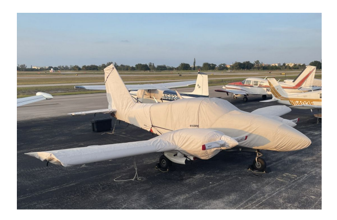
Piper Aztec Complete Cover Set