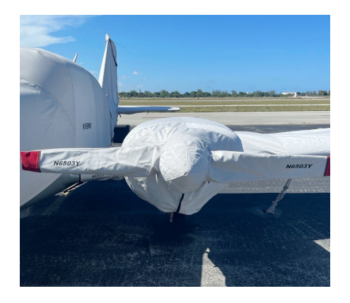
Piper Aztec Propellor Cover

This cover type is made from Silver Acrylic Sunbrella canvas and is 100% lined with a soft and smooth microfiber. Bruce's Custom Covers developed this material combination especially for aircraft protection. The outer material is medium weight and treated for water resistance, UV resistance and anti-static buildup. The inner lining is a very soft and smooth microfiber to prevent scratching. The material is very reflective, and tests show that the cabin interior temperature can be reduced to near-ambient temperature on the hottest of days. It is water, ice and snow repellent, yet breathable to allow moisture to escape from between the cover and the aircraft surface.