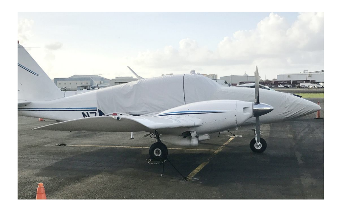
Piper Aztec Canopy/Nose Cover