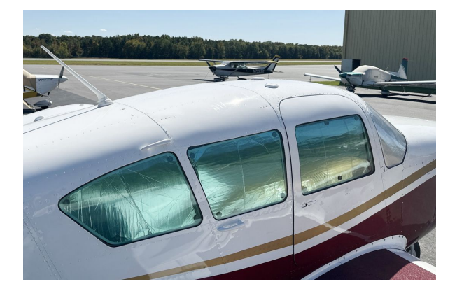
Piper Aztec HeatShields

Windshield Heatshields are interior sunshades for an aircraft's front windshield. The product is a unique composite of closed-cell foam with a silver mylar finish. The semi-rigid design is stiff enough to stand along the inside of the windshield using sun visors or window framing. It folds up flat and easily stores in the included storage sleeve. Some designs may require velcro and suction cups or split right and left sides. A Heatshield is an excellent short-term remedy for cockpit overheating. An external fabric cover is far more effective and practical for long-term protection.