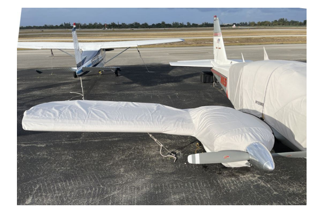
Piper Aztec Extended Canopy/Nose & Wing/Engine Covers

WINTER USE MATERIAL - Made with Solution-Dyed Polyester fabric, this option is intended for seasonal use to aid in deicing, rain mitigation, or for occasional travel. The material is lighter and more compact, but more susceptible to UV damage and may have a shorter useful life if used continuously outside than the all-year use material.