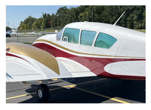
Piper Aztec HeatShields