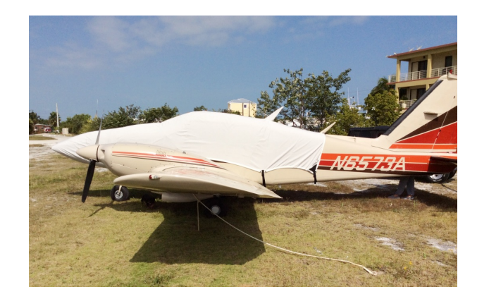
Piper Aztec Canopy/Nose Cover

Travel Covers are made with Silver Solution-Dyed Polyester fabric and only lined over the windshield to save weight. The material is lightweight and more compact for easy stowage in the aircraft. The polyester material is water resistant, but only intended for occasional use outside. We also have an ultra lightweight material available for fitted hangar dust covers. For daily outdoor use, the non-travel Sunbrella Cover is the best choice.