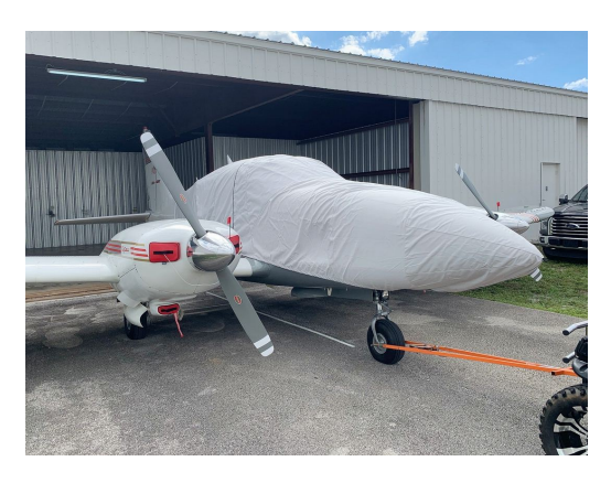
Piper Aztec Extended Canopy/Nose Cover, Engine Plugs