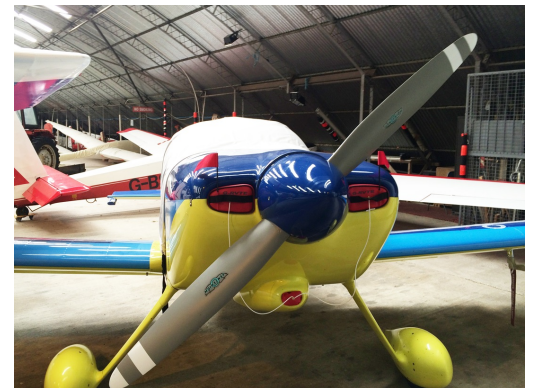
Van's RV-6 Engine Inlet Plugs