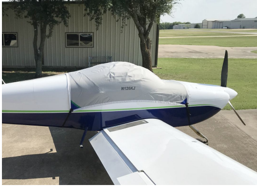
Van's RV-9A Travel Weight Canopy Cover

Travel Covers are made with Silver Solution-Dyed Polyester fabric and only lined over the windshield to save weight. The material is lightweight and more compact for easy stowage in the aircraft. The polyester material is water resistant, but only intended for occasional use outside. We also have an ultra lightweight material available for fitted hangar dust covers. For daily outdoor use, the non-travel Sunbrella Cover is the best choice.