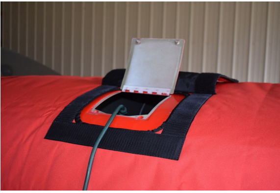
Van's RV-6 Insulated Engine Cover