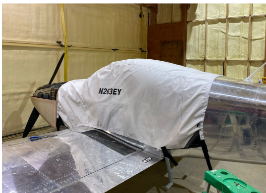
Van's RV-9A Extended Canopy Cover

This cover type is made from Silver Acrylic Sunbrella canvas and is 100% lined with a soft and smooth microfiber. Bruce's Custom Covers developed this material combination especially for aircraft protection. The outer material is medium weight and treated for water resistance, UV resistance and anti-static buildup. The inner lining is a very soft and smooth microfiber to prevent scratching. The material is very reflective, and tests show that the cabin interior temperature can be reduced to near-ambient temperature on the hottest of days. It is water, ice and snow repellent, yet breathable to allow moisture to escape from between the cover and the aircraft surface.