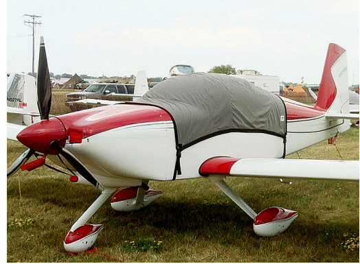
Van's RV-9 Travel Canopy Cover