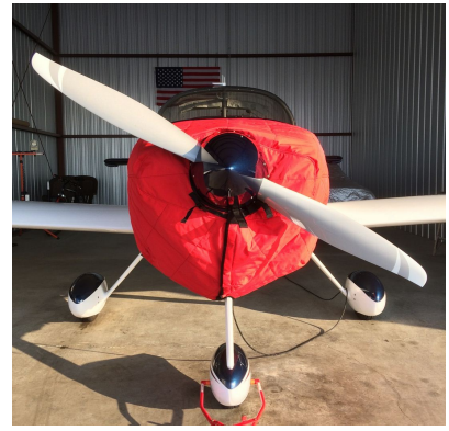
Van's RV-9A Insulated Engine Cover