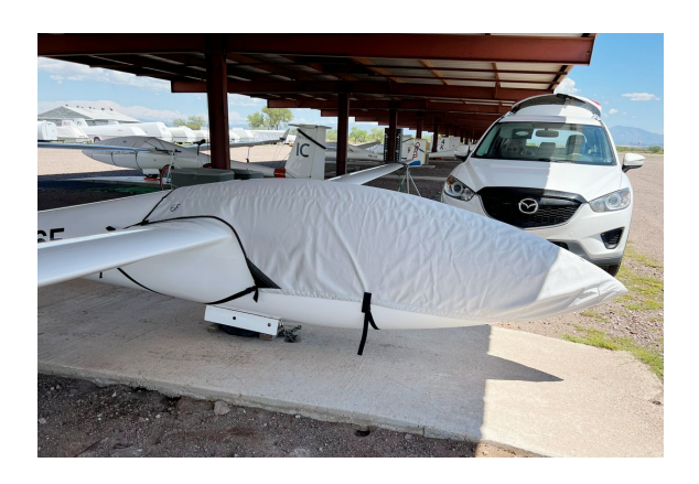
Schleicher ASW-19 Canopy/Nose Cover