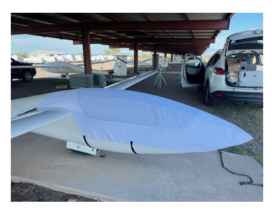
Schleicher ASW-19 Canopy/Nose Cover, test fit cover