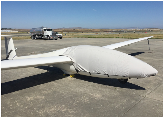
Schleicher ASK-21 Canopy/Nose Cover