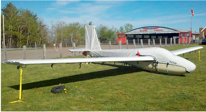
Schweizer 1-26B Canopy/Nose, Empennage & Wing Covers