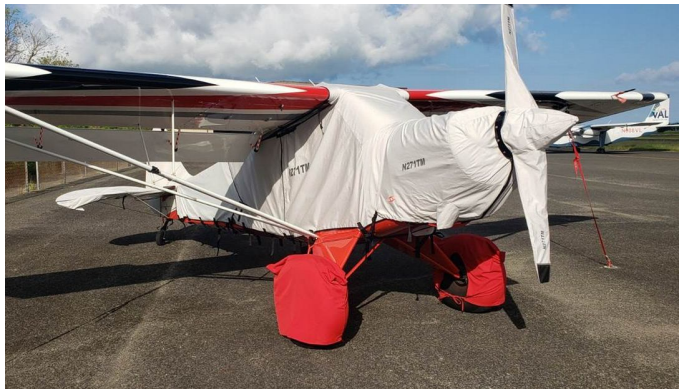
Aviat Husky Extended Canopy Cover, Engine, Prop, Empennage & Tire Covers