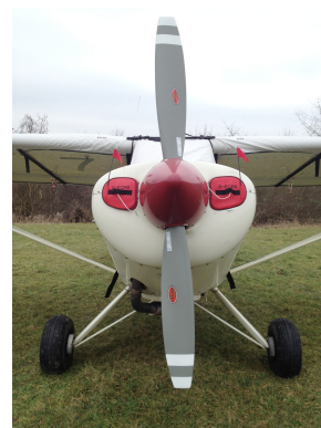
Aviat Husky Engine Plugs, Wing Covers