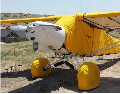
Piper PA-18 Super Cub Extended Canopy Cover, Wing & Tire Covers

ALL-YEAR USE MATERIAL - Made with Silver Acrylic Sunbrella canvas, the all-year use material is the best option for sun protection and cover longevity. This heavier more durable material is intended for all weather conditions, such as rain and snow or lots of sun.