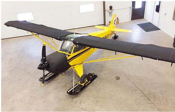
Aviat Husky Insulated Engine Cover, Wing Covers

This cover type is made from Silver Acrylic Sunbrella canvas and is 100% lined with a soft and smooth microfiber. Bruce's Custom Covers developed this material combination especially for aircraft protection. The outer material is medium weight and treated for water resistance, UV resistance and anti-static buildup. The inner lining is a very soft and smooth microfiber to prevent scratching. The material is very reflective, and tests show that the cabin interior temperature can be reduced to near-ambient temperature on the hottest of days. It is water, ice and snow repellent, yet breathable to allow moisture to escape from between the cover and the aircraft surface.