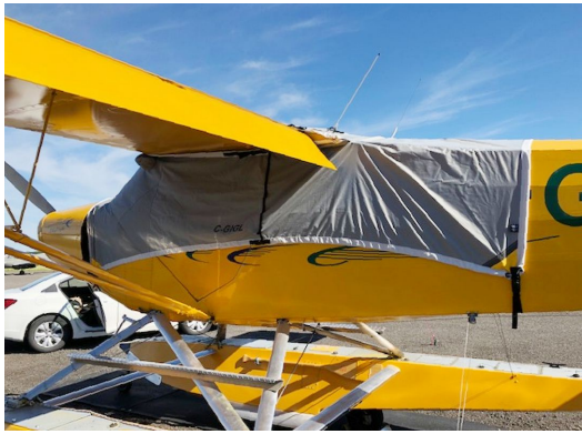
Sportsman 2+2 Wag Aero Light Weight Over the Top Travel Canopy Cover