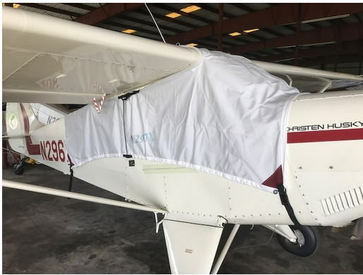
Aviat Husky Canopy Cover

This cover type is made from Silver Acrylic Sunbrella canvas and is 100% lined with a soft and smooth microfiber. Bruce's Custom Covers developed this material combination especially for aircraft protection. The outer material is medium weight and treated for water resistance, UV resistance and anti-static buildup. The inner lining is a very soft and smooth microfiber to prevent scratching. The material is very reflective, and tests show that the cabin interior temperature can be reduced to near-ambient temperature on the hottest of days. It is water, ice and snow repellent, yet breathable to allow moisture to escape from between the cover and the aircraft surface.