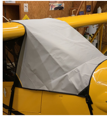
Cub Crafters Carbon Cub FX3 Windshield/Skylight Cover, travel weight