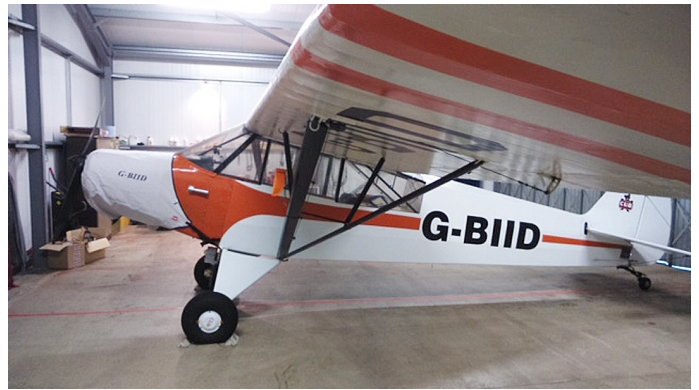
Piper Super Cub Engine Cover