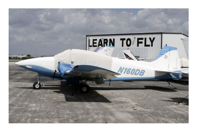
Piper Apache/Geronimo Canopy Cover