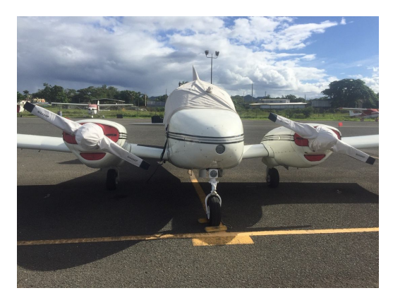
Piper Apache Engine Plugs, Prop Covers

This cover type is made from Silver Acrylic Sunbrella canvas and is 100% lined with a soft and smooth microfiber. Bruce's Custom Covers developed this material combination especially for aircraft protection. The outer material is medium weight and treated for water resistance, UV resistance and anti-static buildup. The inner lining is a very soft and smooth microfiber to prevent scratching. The material is very reflective, and tests show that the cabin interior temperature can be reduced to near-ambient temperature on the hottest of days. It is water, ice and snow repellent, yet breathable to allow moisture to escape from between the cover and the aircraft surface.