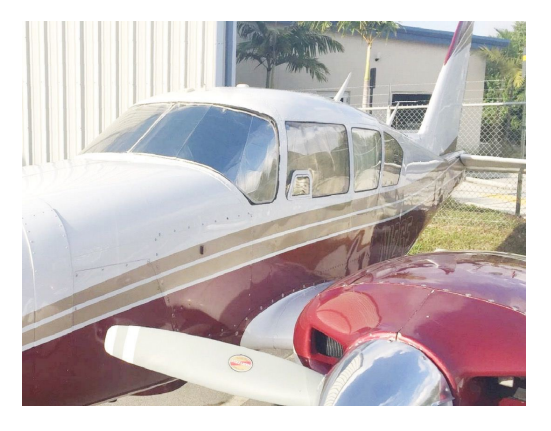
Piper Aztec HeatShield Set