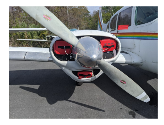
Piper PA-23 Apache Engine Inlet Plugs (fit needs improvement)