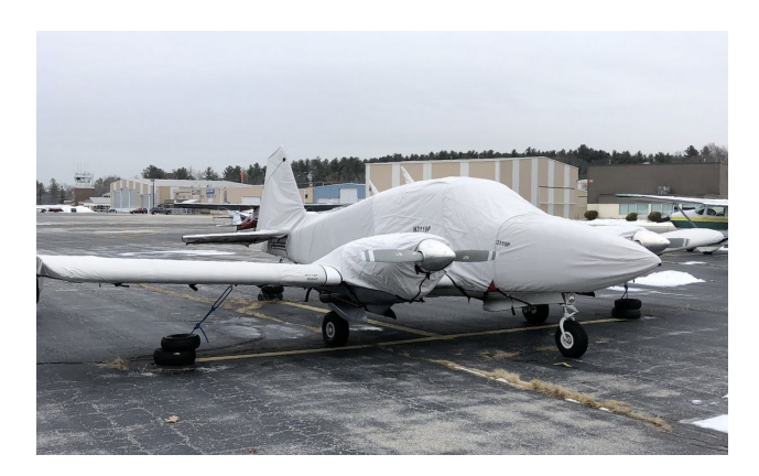
Piper PA-23 Apache Geronimo Extended Canopy Cover