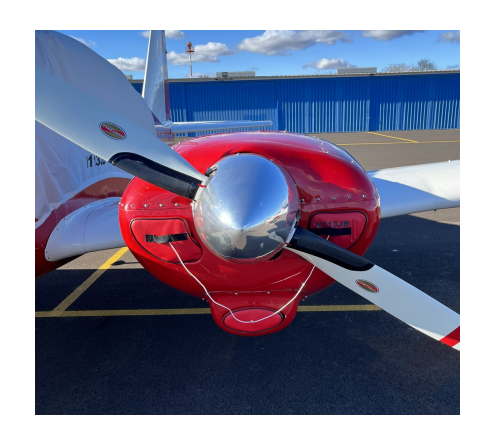
Piper PA-23 Apache Engine Inlet Plugs W/ Oil Cooler Plug

Engine Inlet Plugs are custom fit for your Piper PA-23 Apache intakes, made with heavy-duty vinyl material, and stuffed with a single block of sculpted urethane foam. Each plug has a zipper that allows the foam to be removed and dried if necessary. Engine plugs have warning flags that are visible from the cockpit or 'remove before flight' streamers sewn onto the face of the plugs. Most plugs are imprinted with the aircraft registration number in black for an extra charge. Storage bag NOT included. Engine plugs may be inserted after flight when the engine is still warm. Engine Inlet Plugs are commonly referred to as Cowl Plugs, Intake Plugs, Cowl Blocks, Engine Blocks, and Engine Bungs.