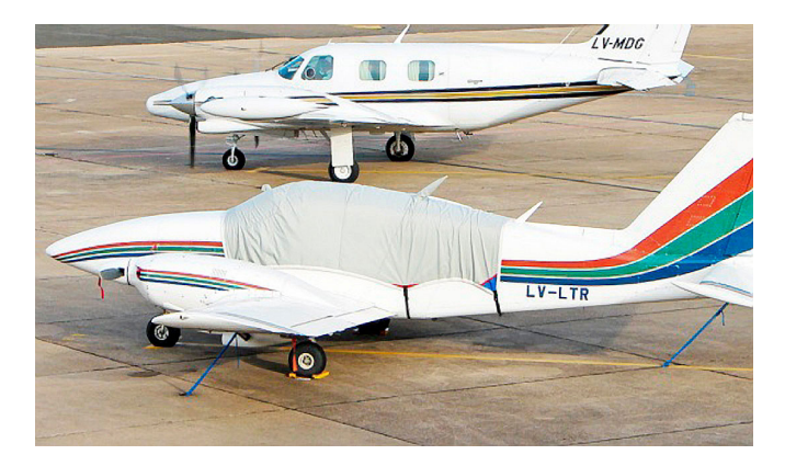
Aztec Canopy Cover

This cover type is made from Silver Acrylic Sunbrella canvas and is 100% lined with a soft and smooth microfiber. Bruce's Custom Covers developed this material combination especially for aircraft protection. The outer material is medium weight and treated for water resistance, UV resistance and anti-static buildup. The inner lining is a very soft and smooth microfiber to prevent scratching. The material is very reflective, and tests show that the cabin interior temperature can be reduced to near-ambient temperature on the hottest of days. It is water, ice and snow repellent, yet breathable to allow moisture to escape from between the cover and the aircraft surface.